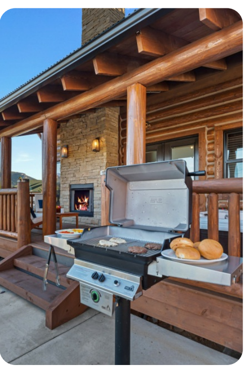
Estes Park 14 | Page 5 of 7