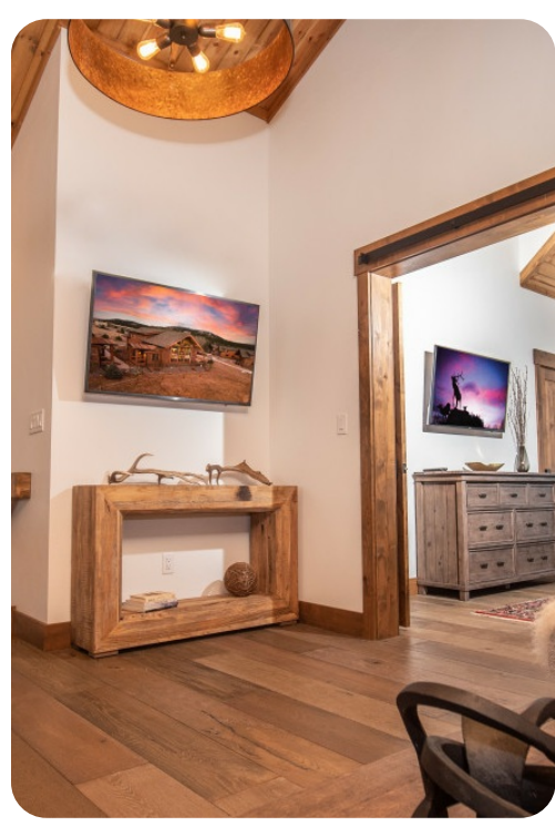
Estes Park 14 | Page 2 of 7