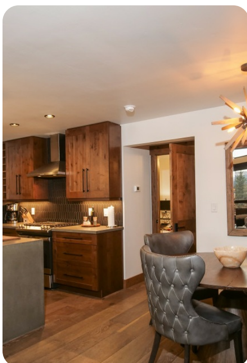
Estes Park 14 | Page 3 of 7