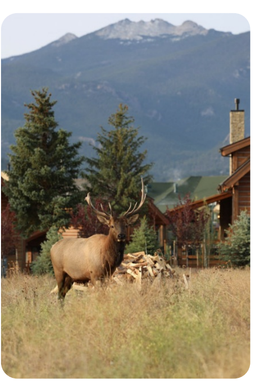
Estes Park 14 | Page 6 of 7