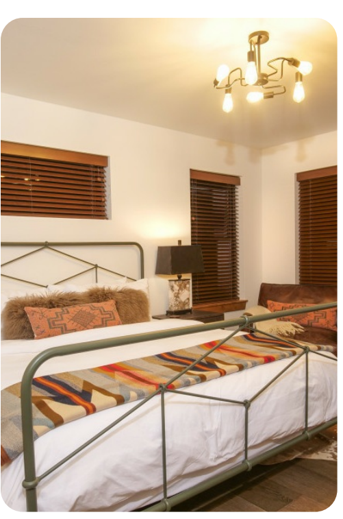
Estes Park 14 | Page 4 of 7