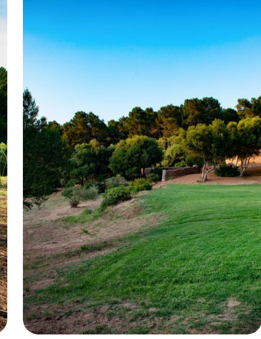
Es Raco de LArxiduc | Page 4 of 8