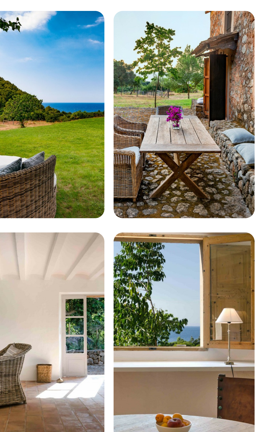
Es Raco de LArxiduc | Page 7 of 8