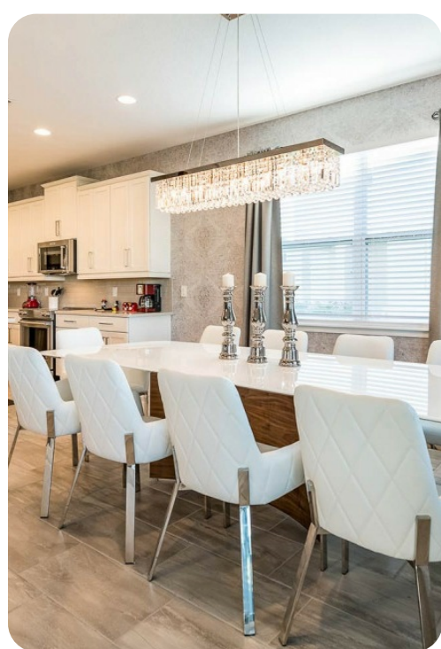
Encore Resort 642 | Page 3 of 8