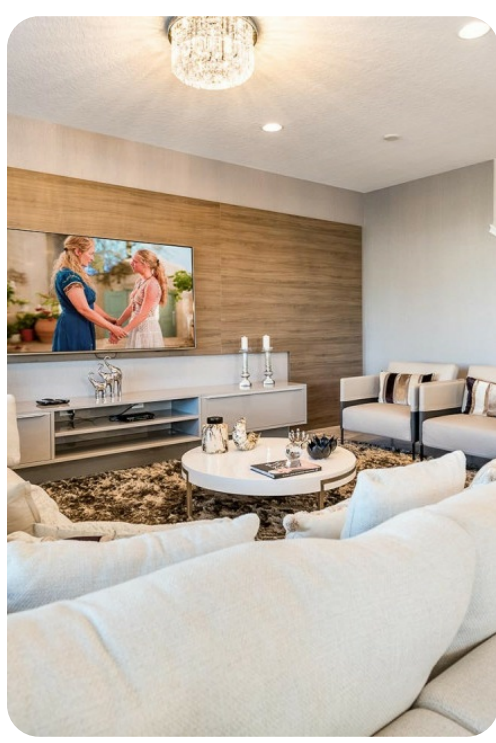
Encore Resort 642 | Page 2 of 8