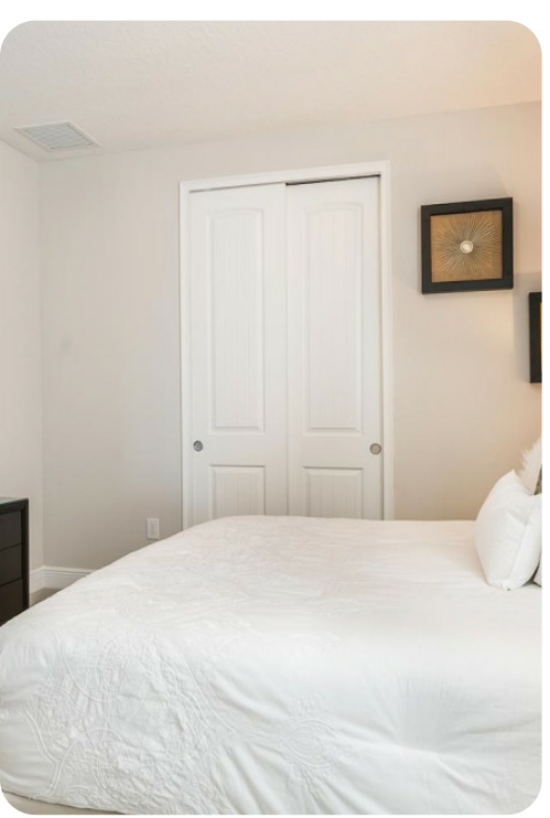
Encore Resort 642 | Page 8 of 8