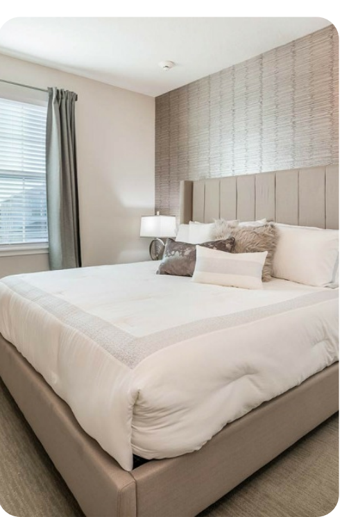
Encore Resort 642 | Page 5 of 8