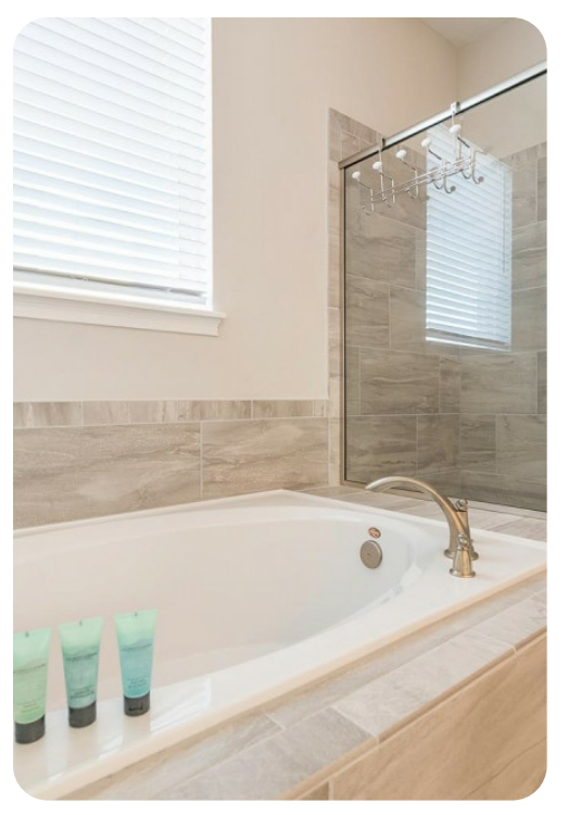
Encore Resort 642 | Page 4 of 8