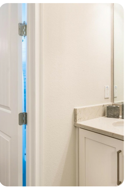
Encore Resort 642 | Page 7 of 8