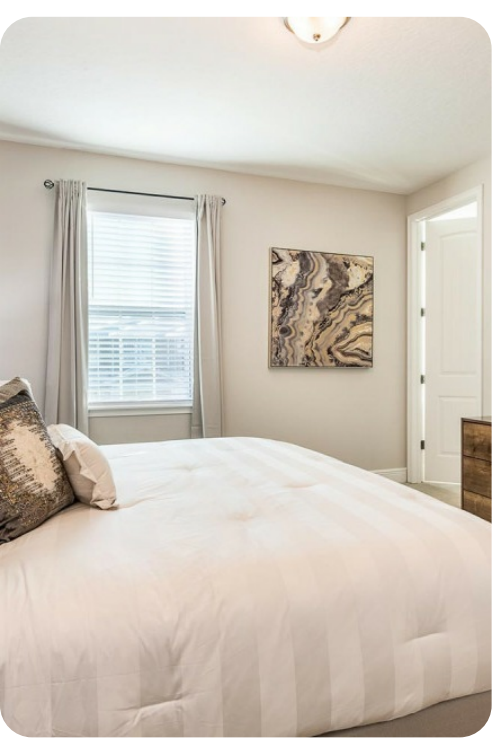
Encore Resort 642 | Page 6 of 8