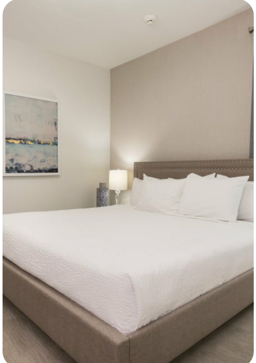
Encore Resort 431 | Page 4 of 8