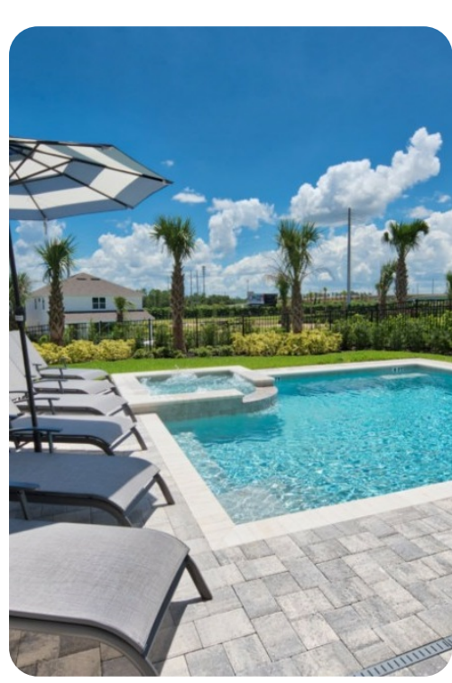
Encore Resort 368 | Page 2 of 8