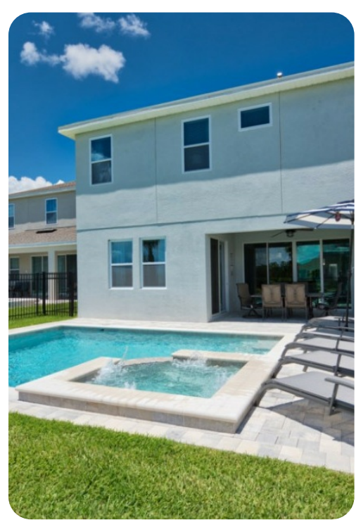
Encore Resort 368 | Page 3 of 8