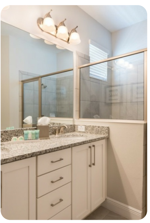
Encore Resort 368 | Page 7 of 8