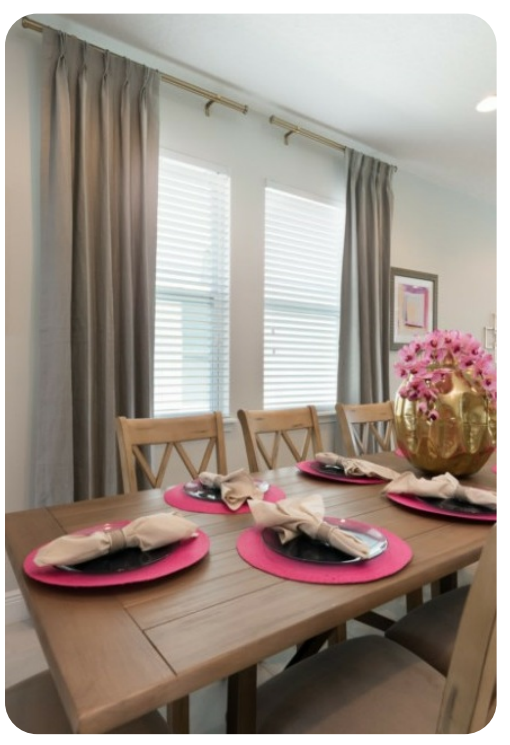
Encore Resort 368 | Page 8 of 8