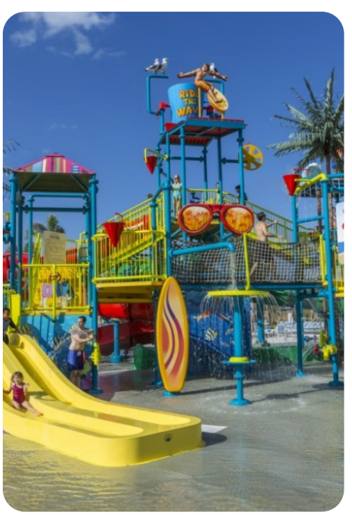
Encore Resort 368 | Page 6 of 8