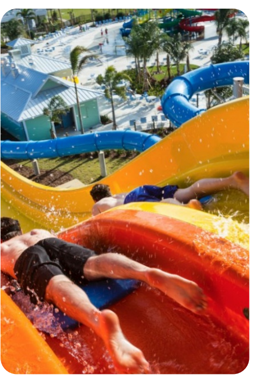
Encore Resort 368 | Page 4 of 8