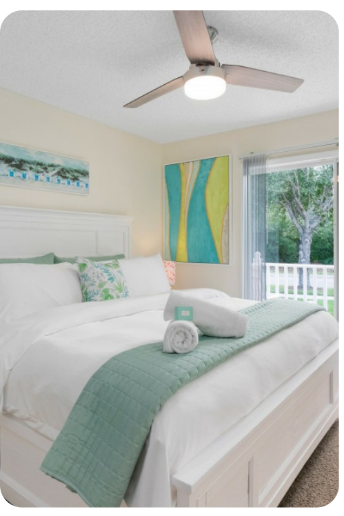
Emerald Island Resort 46 | Page 4 of 8