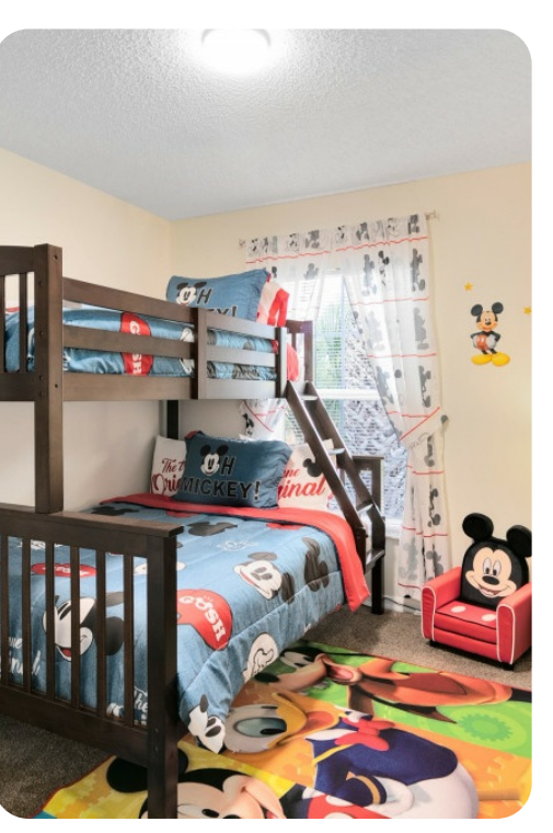
Emerald Island Resort 46 | Page 5 of 8