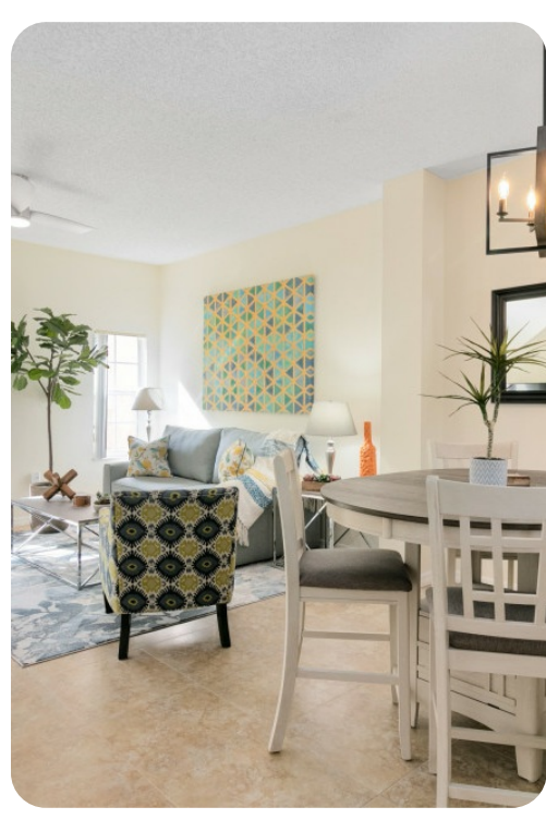
Emerald Island Resort 46 | Page 2 of 8