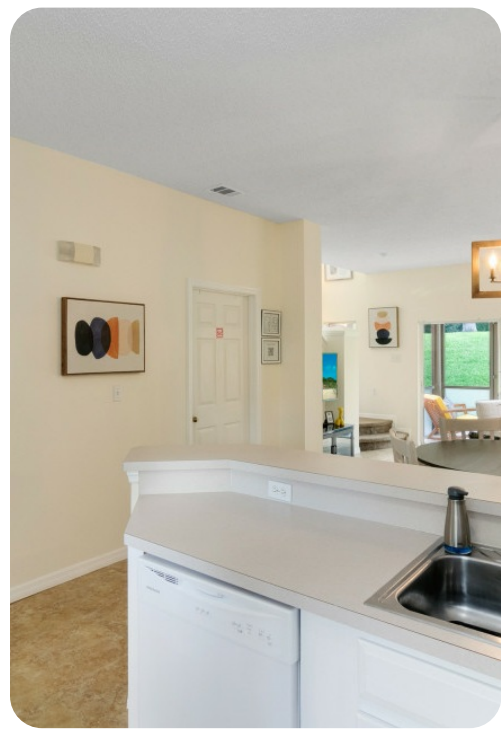
Emerald Island Resort 46 | Page 3 of 8