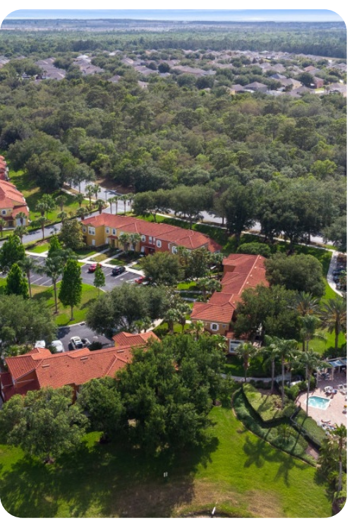
Emerald Island Resort 46 | Page 7 of 8