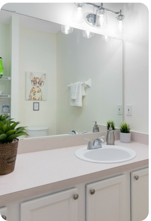
Emerald Island Resort 46 | Page 6 of 8