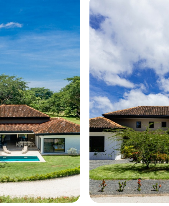
Costa Rica 47 | Page 7 of 8