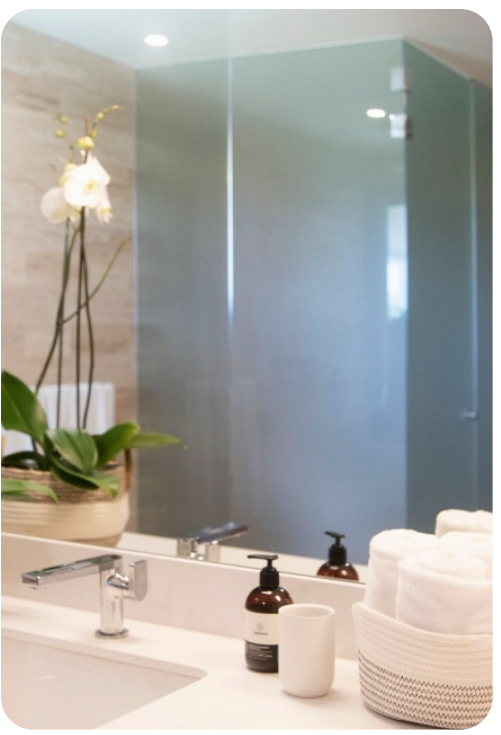
Costa Rica 46 | Page 4 of 8