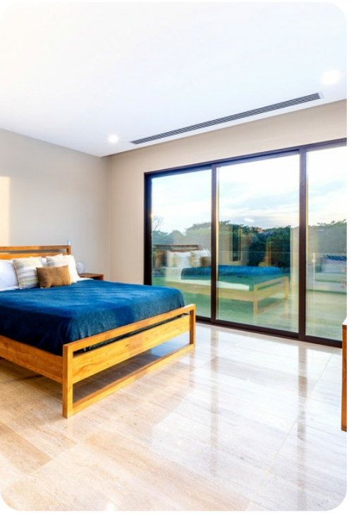
Costa Rica 46 | Page 6 of 8