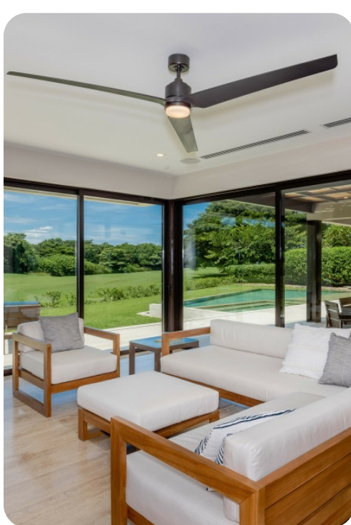
Costa Rica 46 | Page 2 of 8