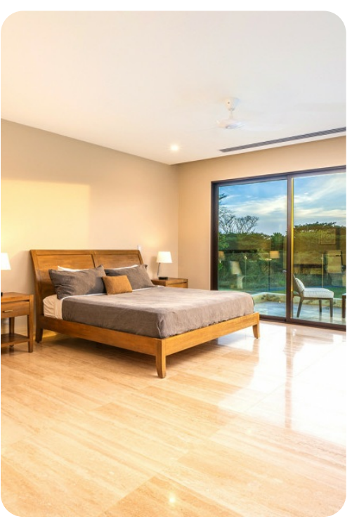
Costa Rica 46 | Page 5 of 8