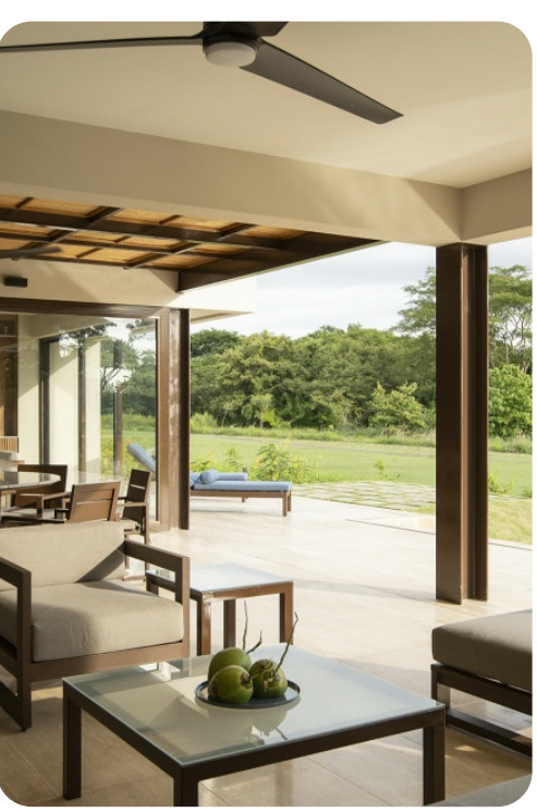
Costa Rica 46 | Page 8 of 8