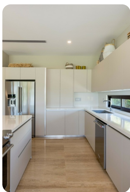
Costa Rica 46 | Page 3 of 8