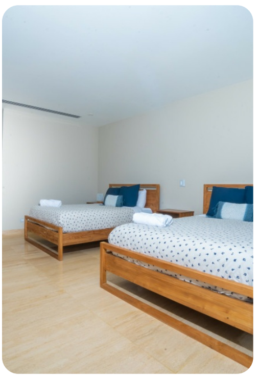
Costa Rica 46 | Page 7 of 8