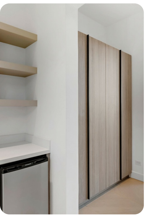
Costa Rica 216 | Page 8 of 8