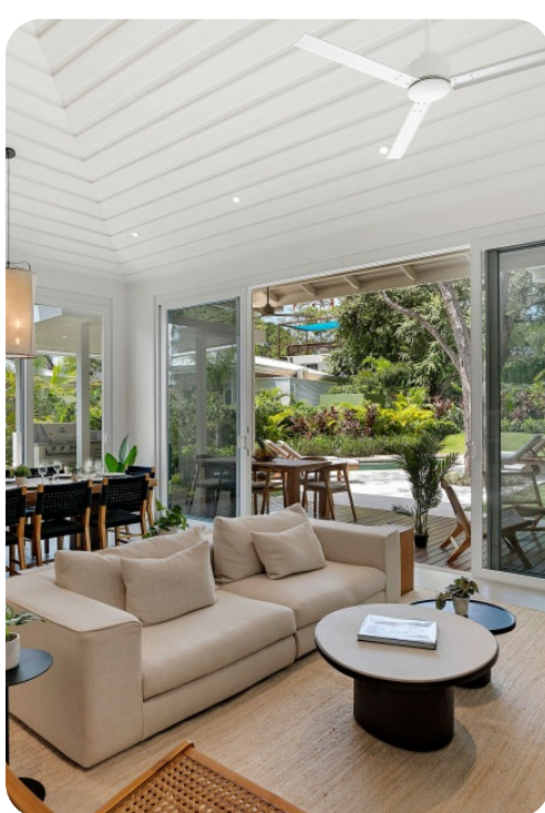
Costa Rica 216 | Page 2 of 8