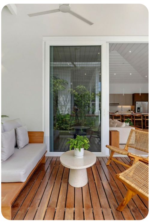
Costa Rica 216 | Page 7 of 8