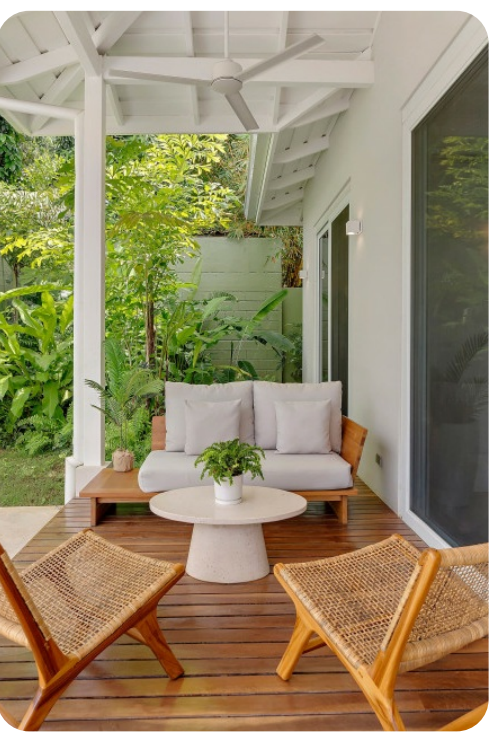
Costa Rica 216 | Page 6 of 8