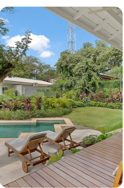
Costa Rica 216 | Page 5 of 8