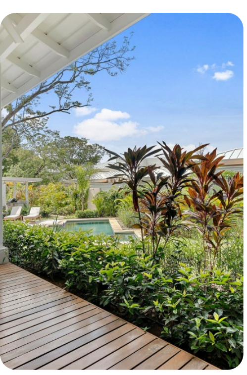
Costa Rica 216 | Page 4 of 8