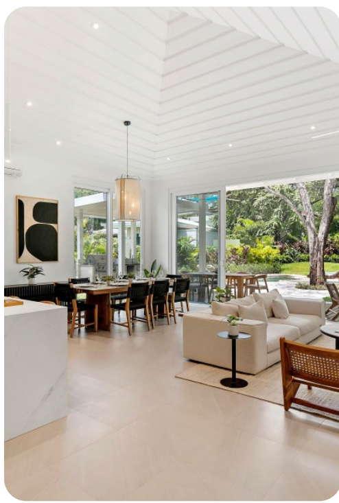
Costa Rica 216 | Page 3 of 8