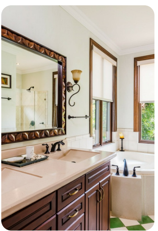
Costa Rica 119 | Page 4 of 8