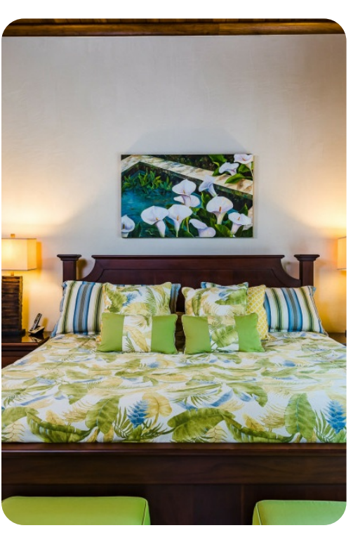
Costa Rica 119 | Page 5 of 8