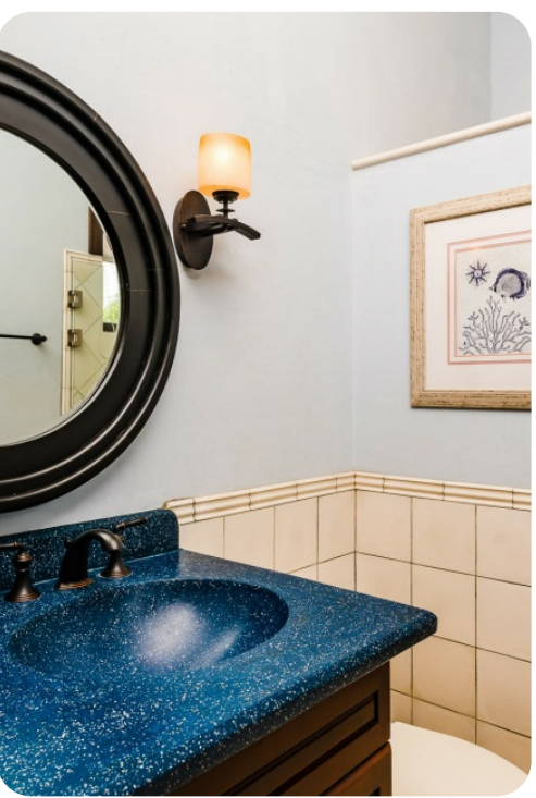
Costa Rica 119 | Page 6 of 8