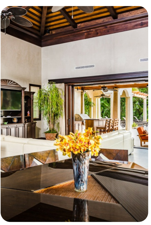
Costa Rica 119 | Page 2 of 8