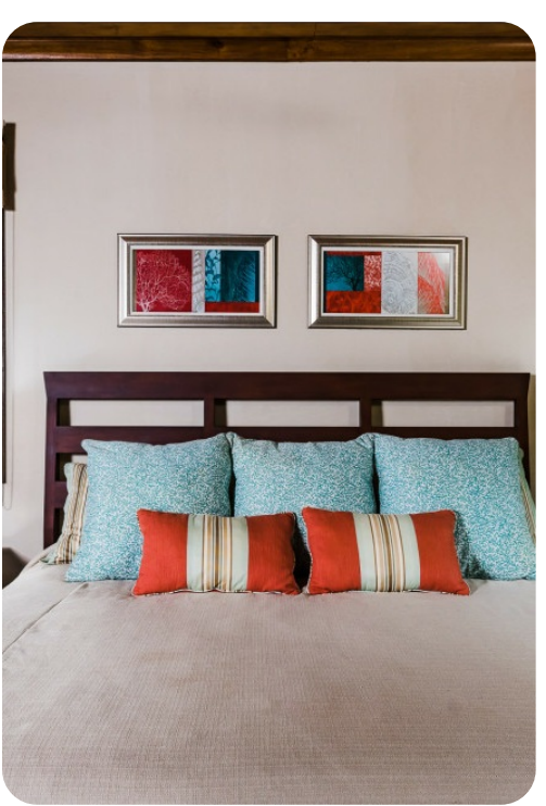
Costa Rica 119 | Page 7 of 8