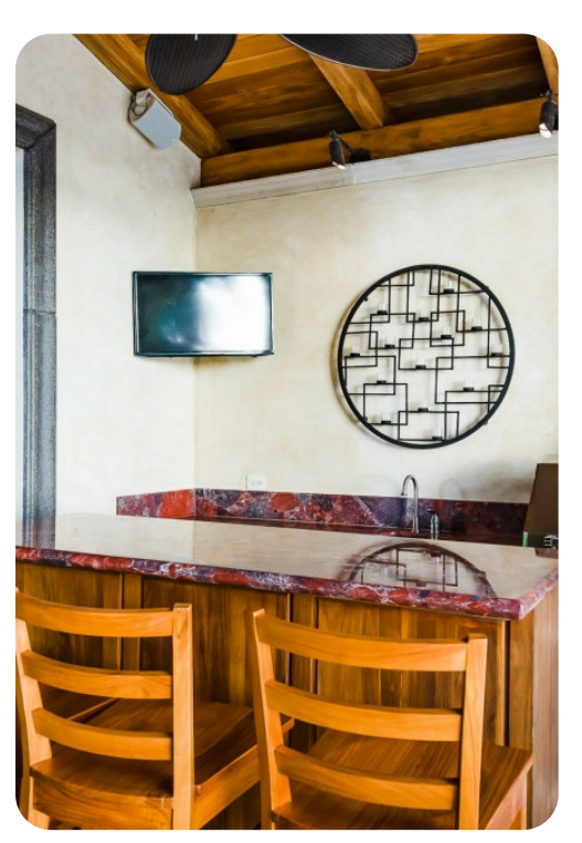
Costa Rica 119 | Page 3 of 8