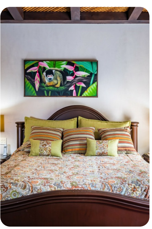
Costa Rica 119 | Page 8 of 8