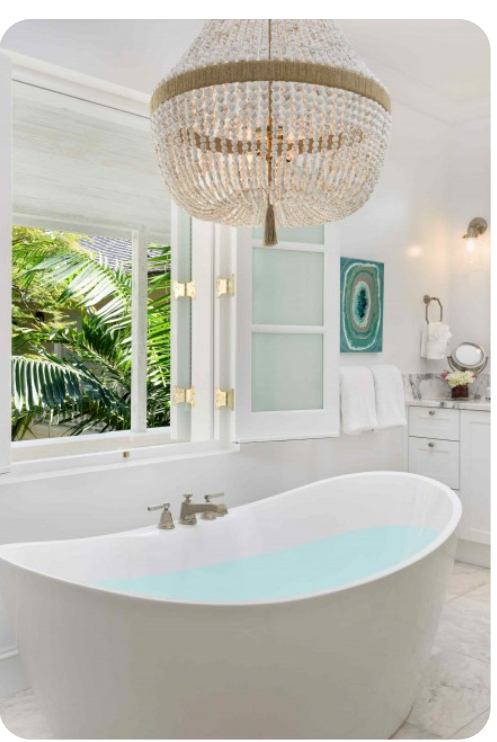
Coral House | Page 4 of 8