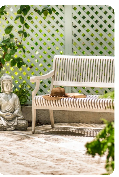
Coral House | Page 8 of 8