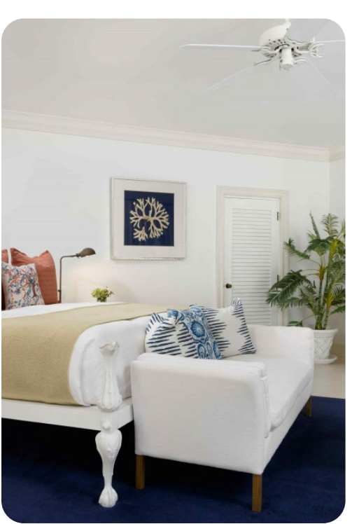
Coral House | Page 5 of 8