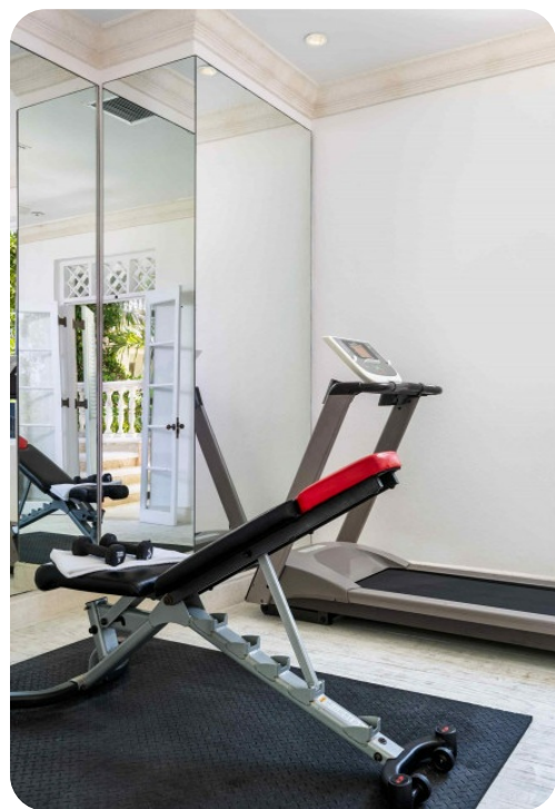
Coral House | Page 2 of 8