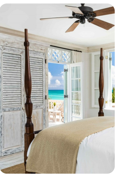
Coral House | Page 6 of 8