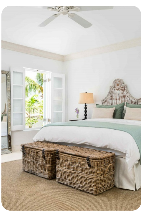
Coral House | Page 7 of 8