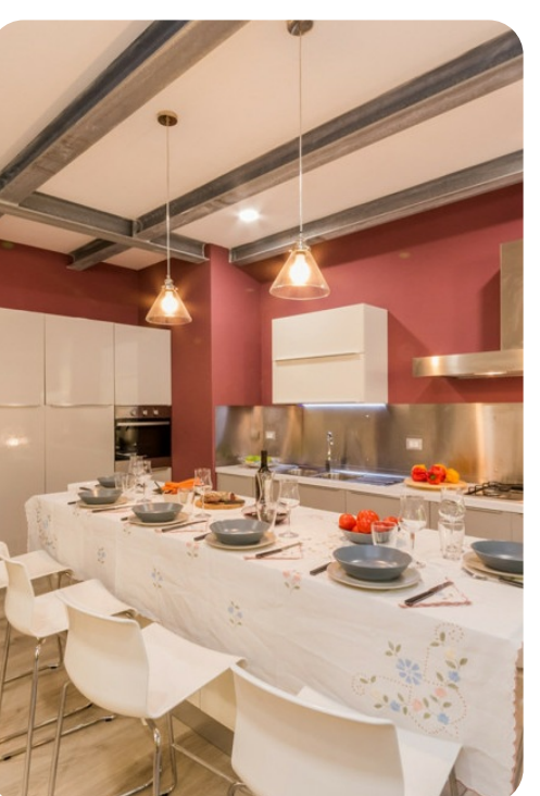
Chipieri | Page 5 of 8