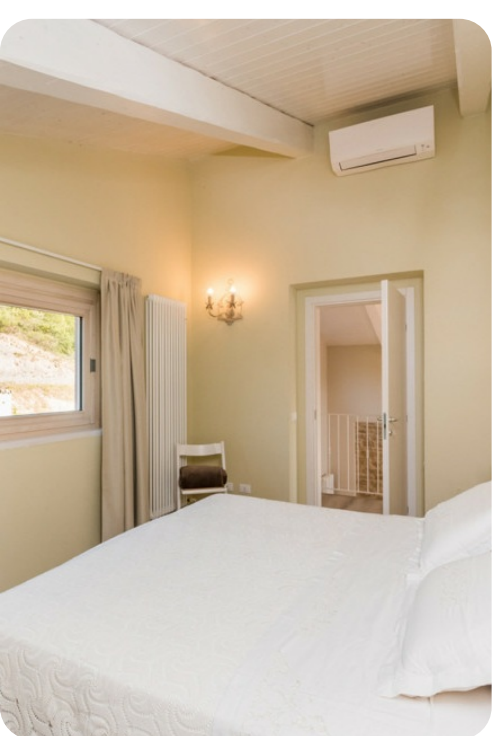
Chipieri | Page 6 of 8