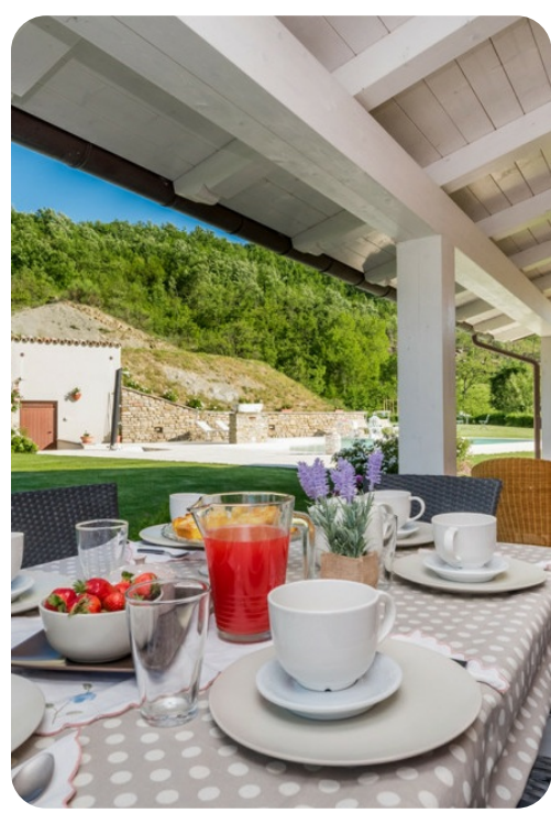
Chipieri | Page 2 of 8