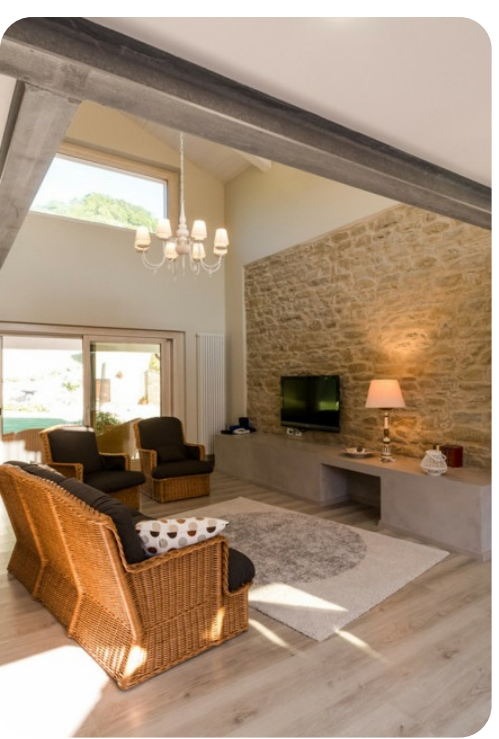
Chipieri | Page 4 of 8