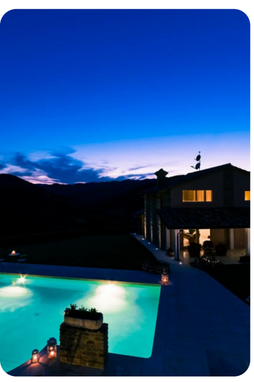
Chipieri | Page 3 of 8