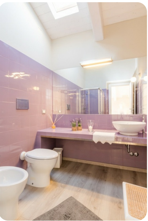
Chipieri | Page 7 of 8