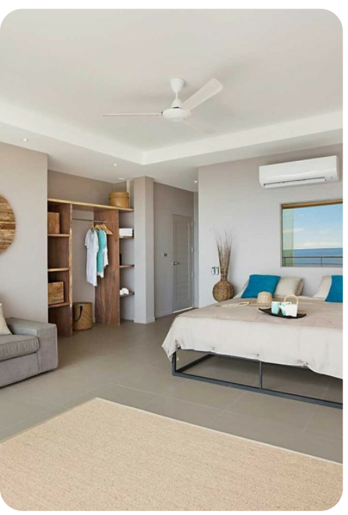
Chaweng 9300 | Page 3 of 5