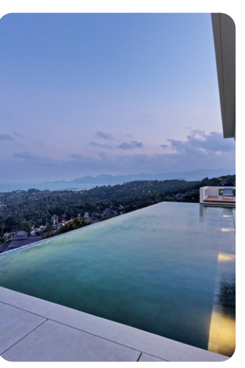
Chaweng 5223 | Page 5 of 8