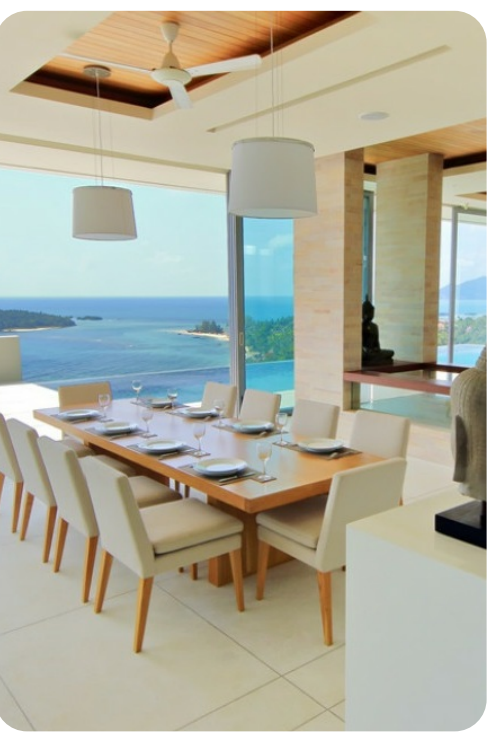
Chaweng 5223 | Page 6 of 8