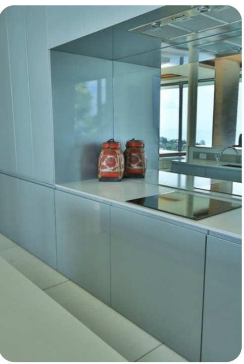
Chaweng 5223 | Page 3 of 8