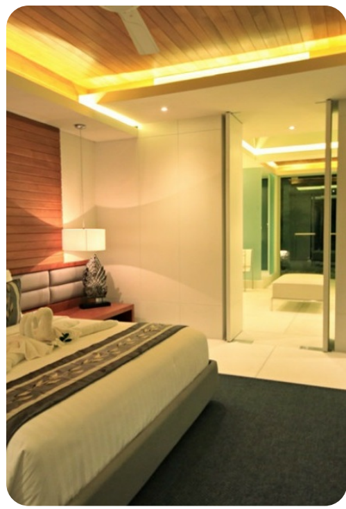
Chaweng 5223 | Page 4 of 8