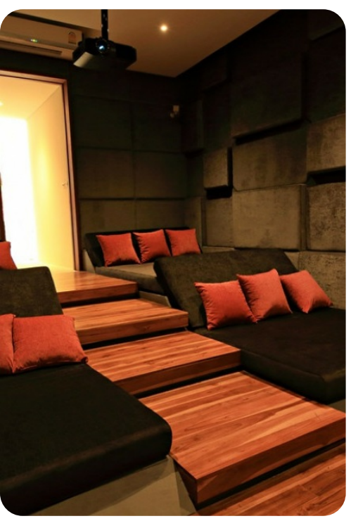
Chaweng 5223 | Page 7 of 8