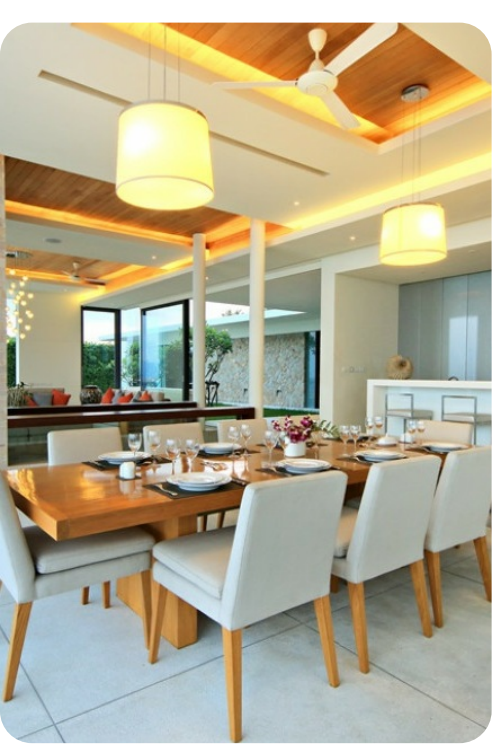
Chaweng 5223 | Page 8 of 8