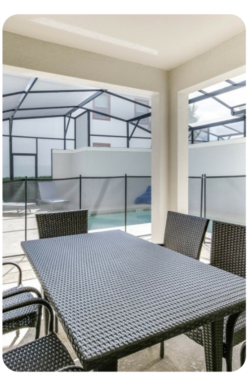
Championsgate 228 | Page 6 of 8