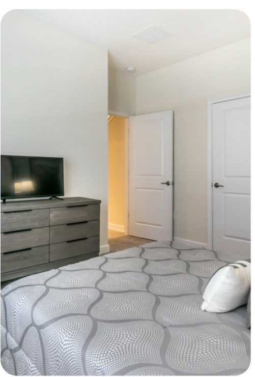
Championsgate 228 | Page 4 of 8