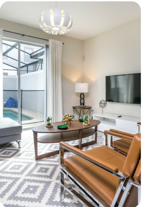
Championsgate 228 | Page 3 of 8