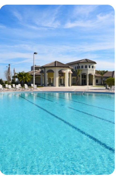
Championsgate 228 | Page 8 of 8