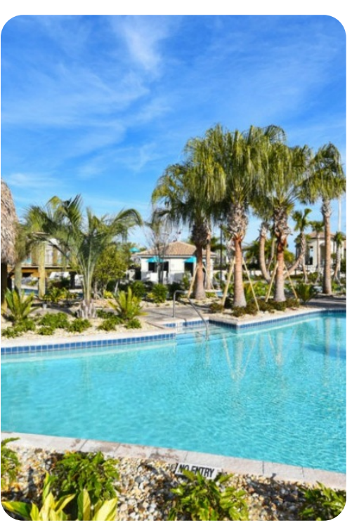
Championsgate 228 | Page 7 of 8