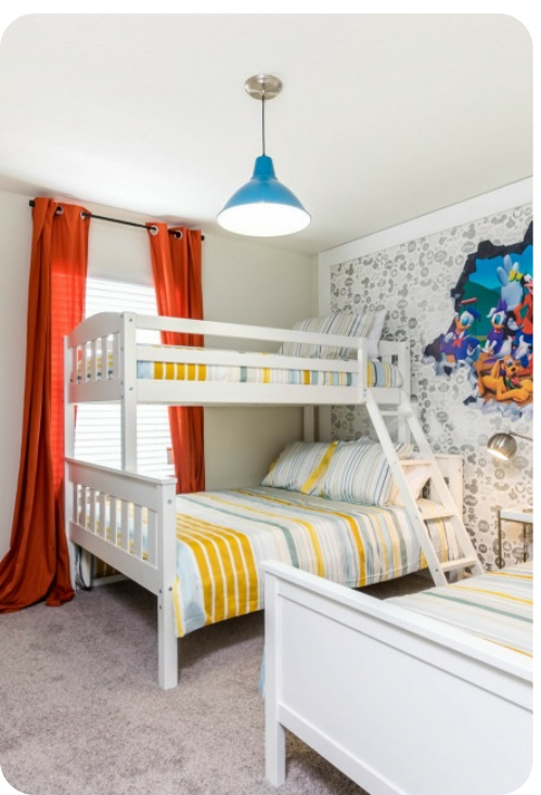
Championsgate 228 | Page 5 of 8