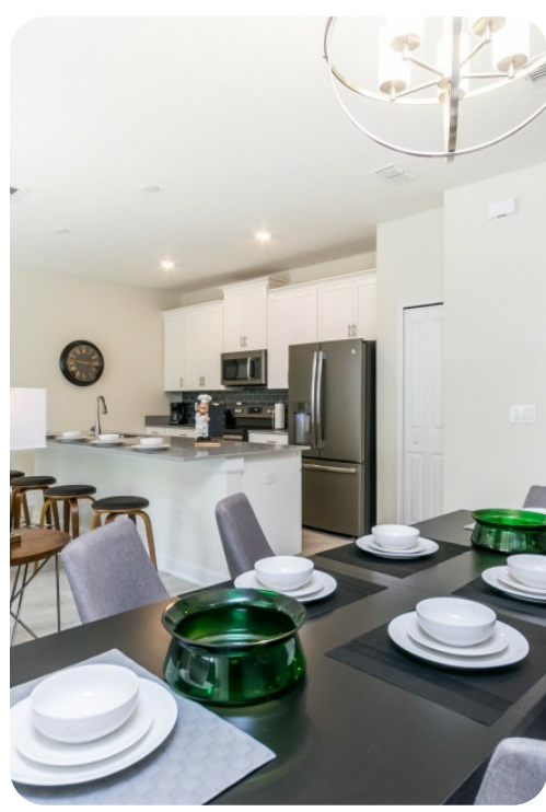
Championsgate 228 | Page 2 of 8