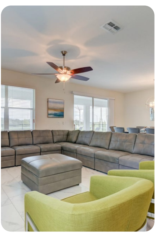
Championsgate 202 | Page 3 of 8