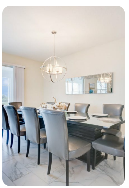
Championsgate 202 | Page 4 of 8