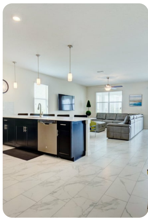
Championsgate 202 | Page 2 of 8