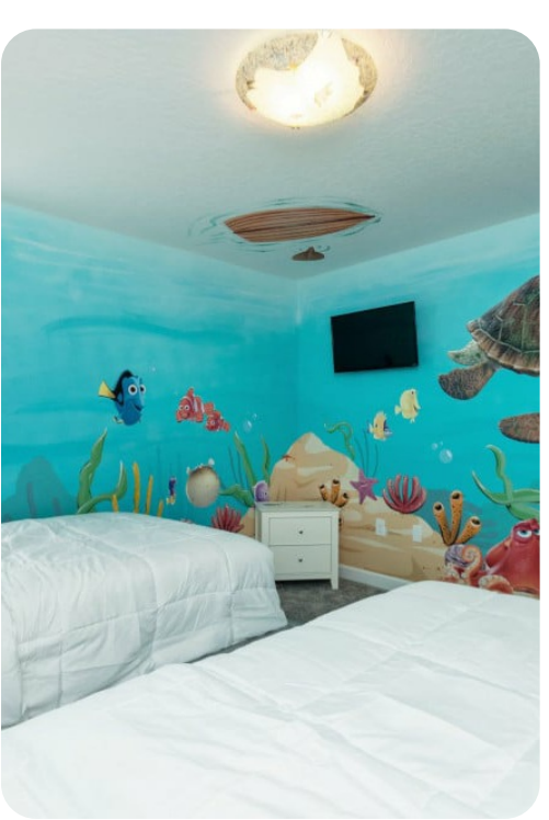
Championsgate 202 | Page 5 of 8