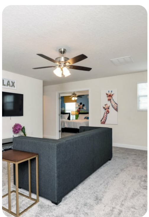
Championsgate 202 | Page 7 of 8