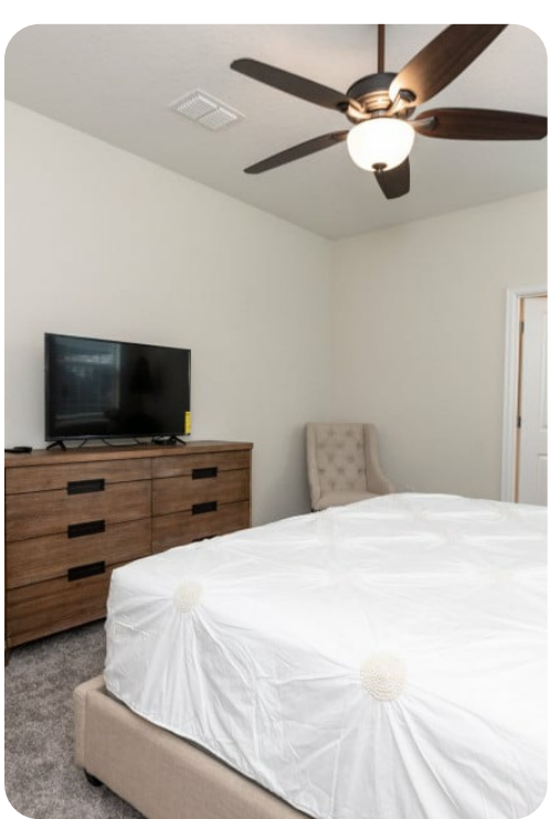
Championsgate 202 | Page 6 of 8