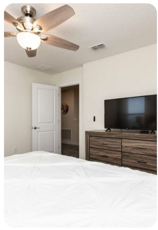
Championsgate 202 | Page 8 of 8