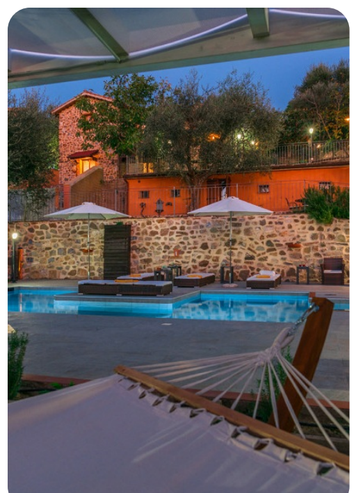
Casale Montegiovi | Page 4 of 8