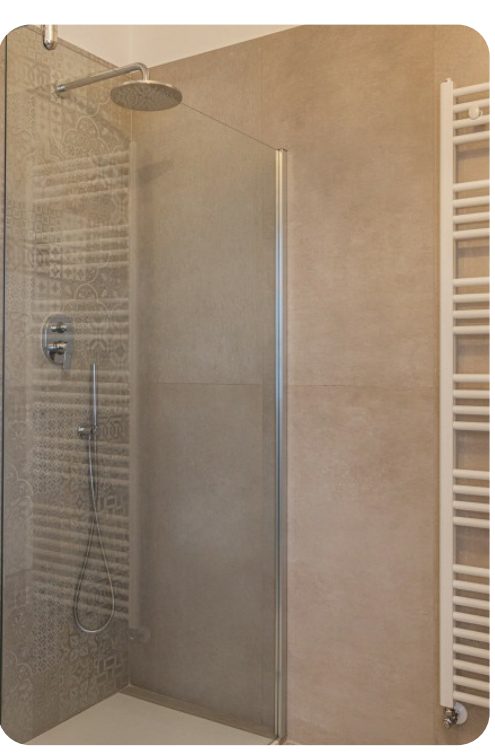
Casale Bella Vita | Page 8 of 8