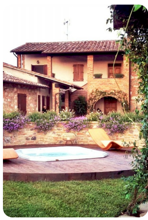
Casale Bella Vita | Page 3 of 8