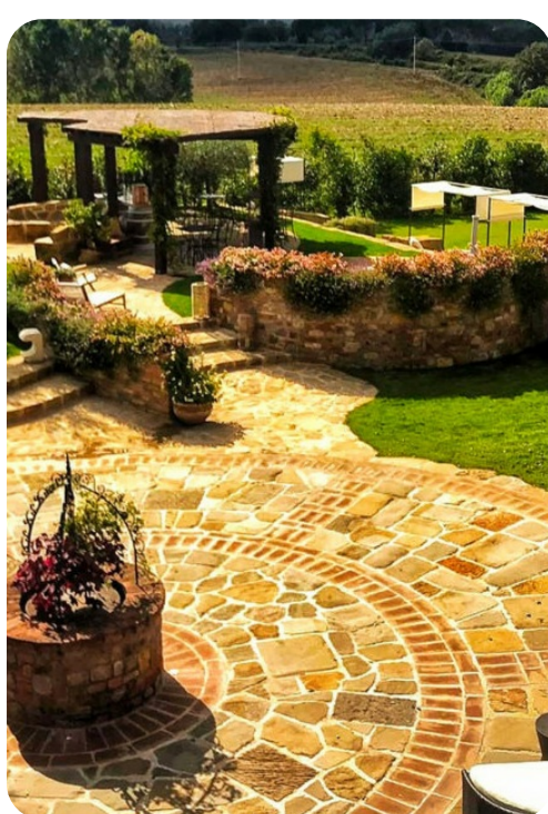
Casale Bella Vita | Page 2 of 8