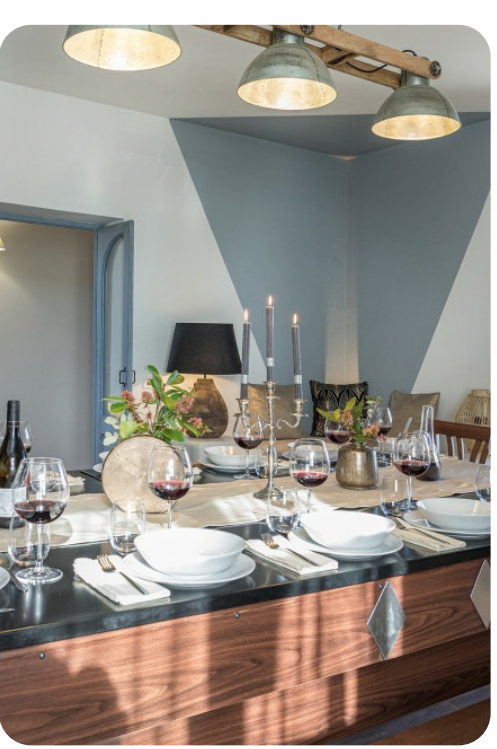
Casale Bella Vita | Page 6 of 8