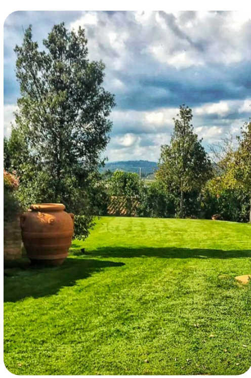
Casale Bella Vita | Page 4 of 8