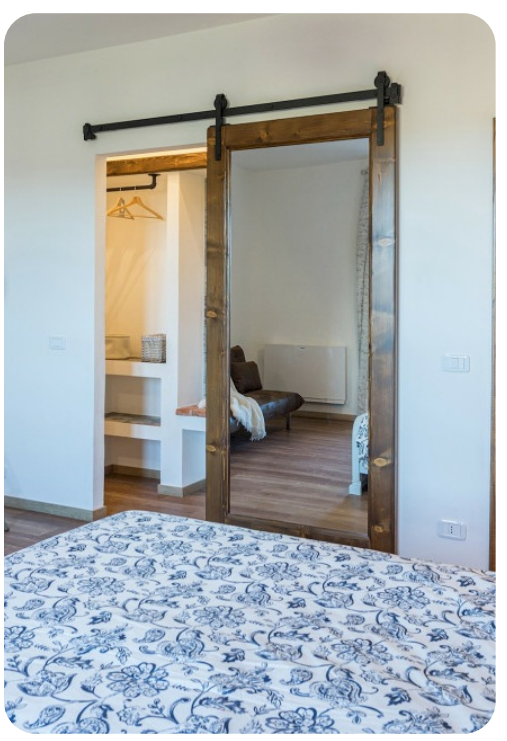
Casale Bella Vita | Page 7 of 8