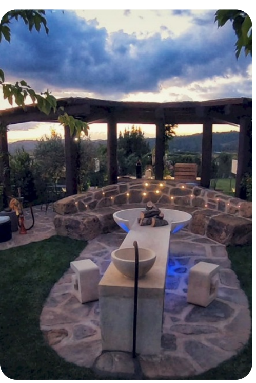
Casale Bella Vita | Page 5 of 8