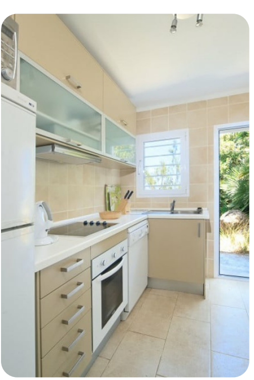
Casablanca Carbo | Page 2 of 4