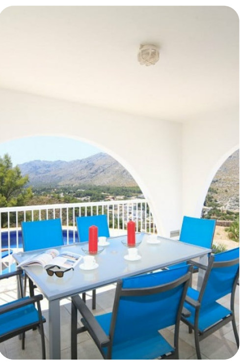
Casablanca Carbo | Page 3 of 4