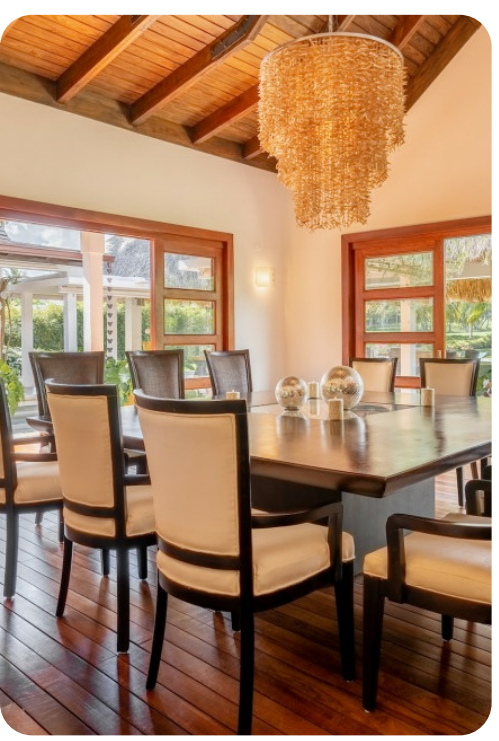
Casa de Campo 43 | Page 6 of 8