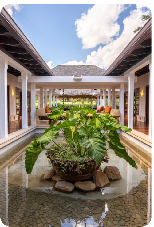
Casa de Campo 43 | Page 5 of 8