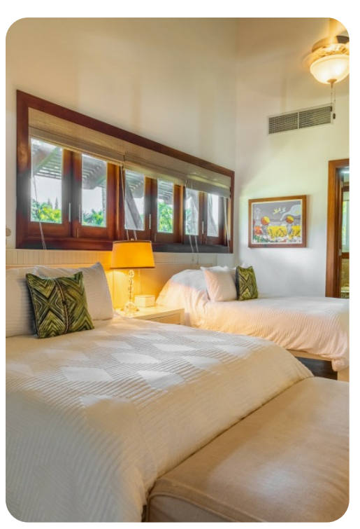
Casa de Campo 43 | Page 4 of 8