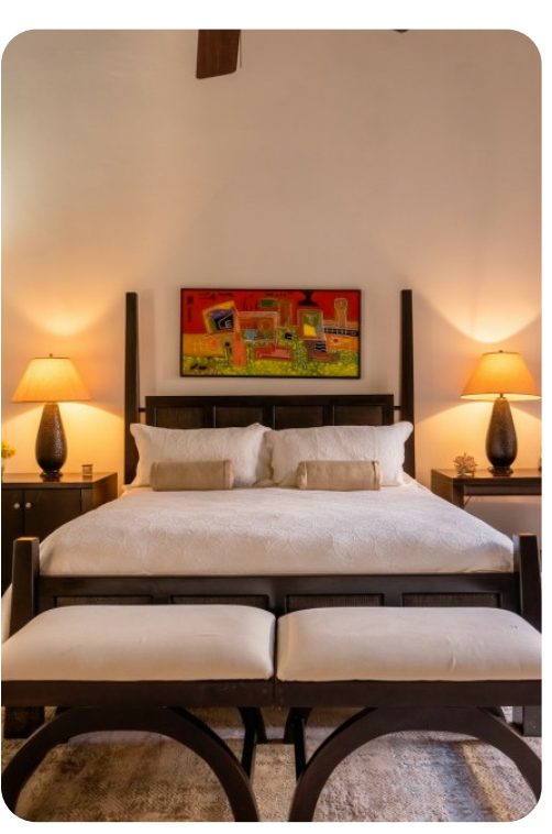
Casa de Campo 43 | Page 8 of 8