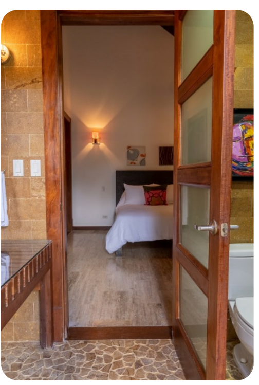
Casa de Campo 43 | Page 2 of 8