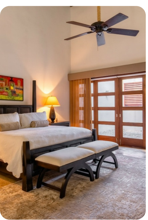
Casa de Campo 43 | Page 7 of 8