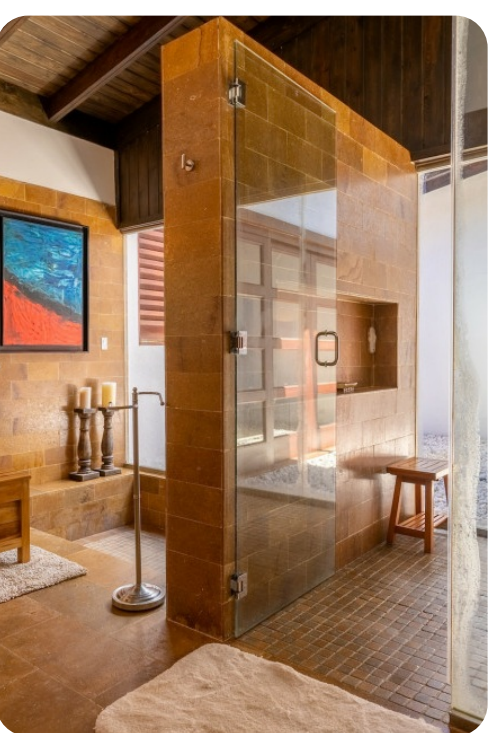
Casa de Campo 43 | Page 3 of 8