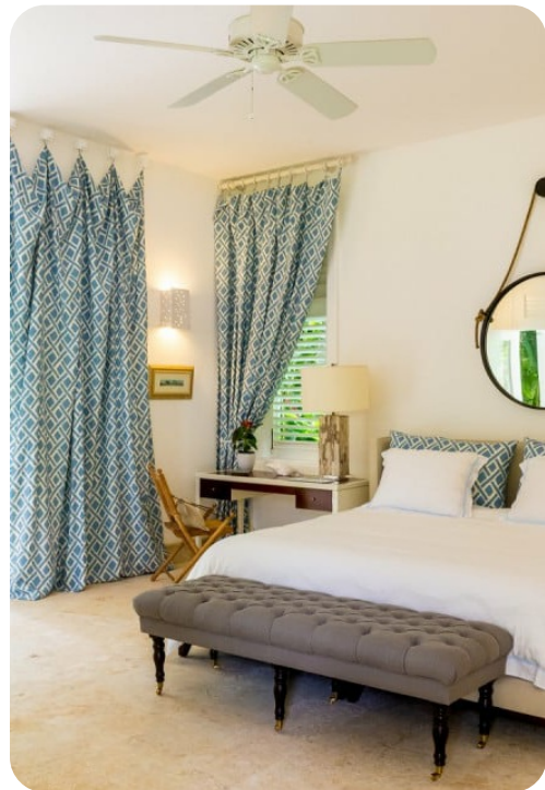
Casa de Campo 24 | Page 3 of 6