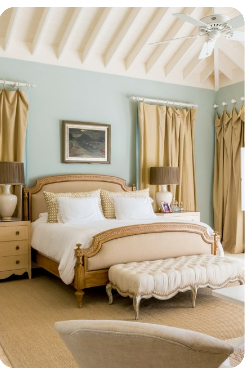
Casa de Campo 24 | Page 5 of 6