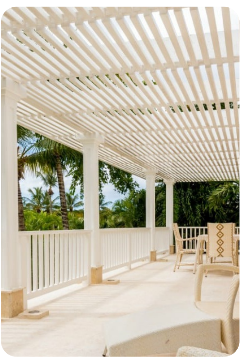
Casa de Campo 24 | Page 6 of 6