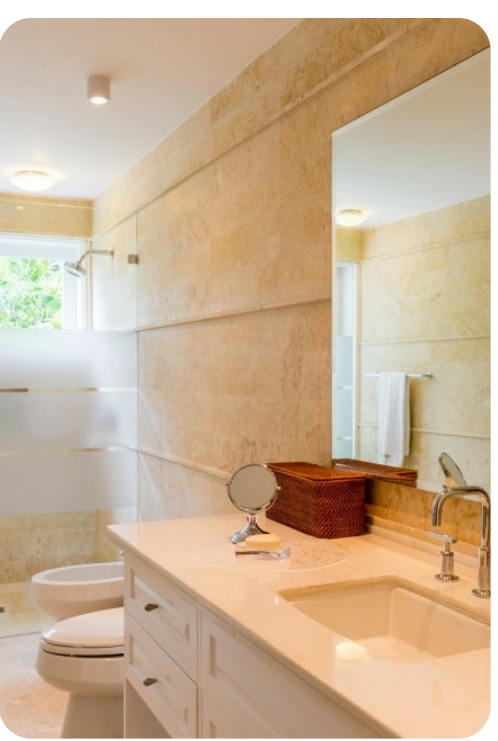
Casa de Campo 24 | Page 4 of 6