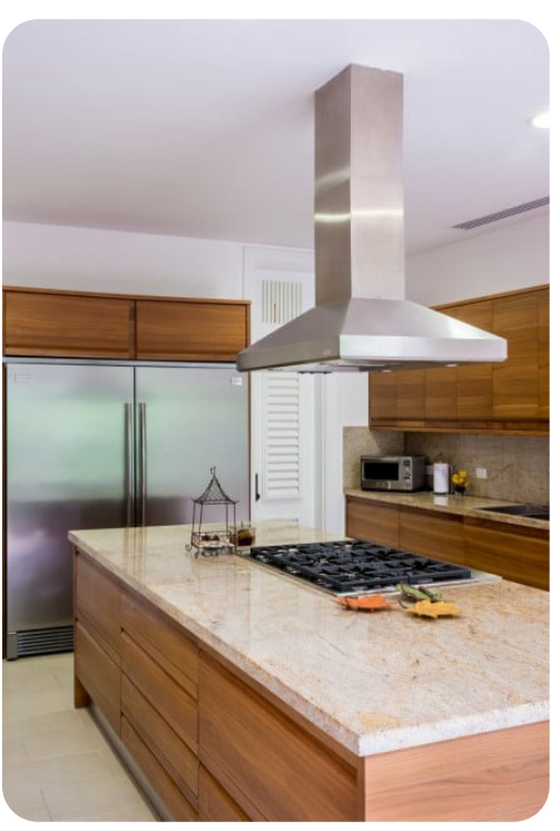
Casa de Campo 24 | Page 2 of 6