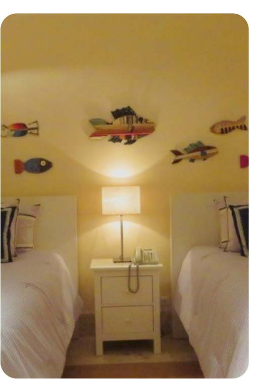
Casa de Campo 151 | Page 5 of 6