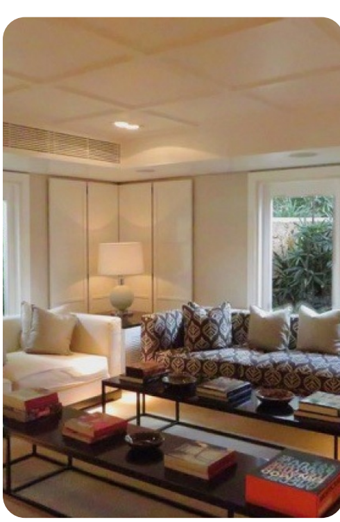
Casa de Campo 151 | Page 3 of 6