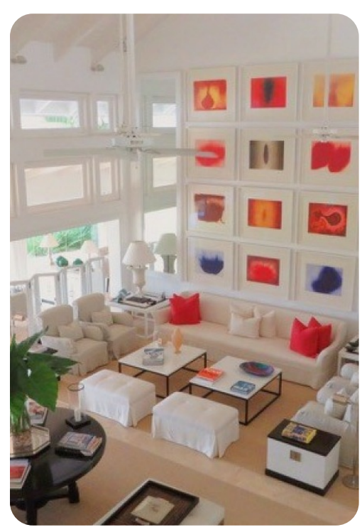
Casa de Campo 151 | Page 2 of 6