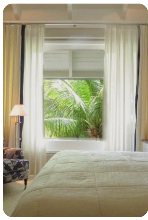
Casa de Campo 151 | Page 4 of 6