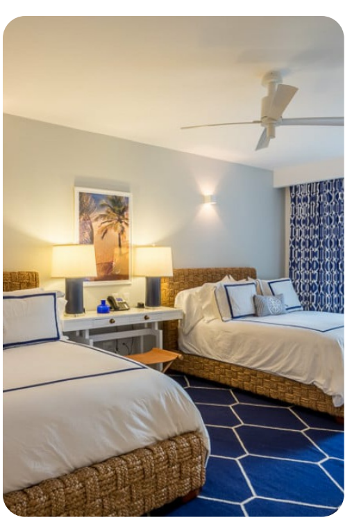
Casa de Campo 12 | Page 4 of 7