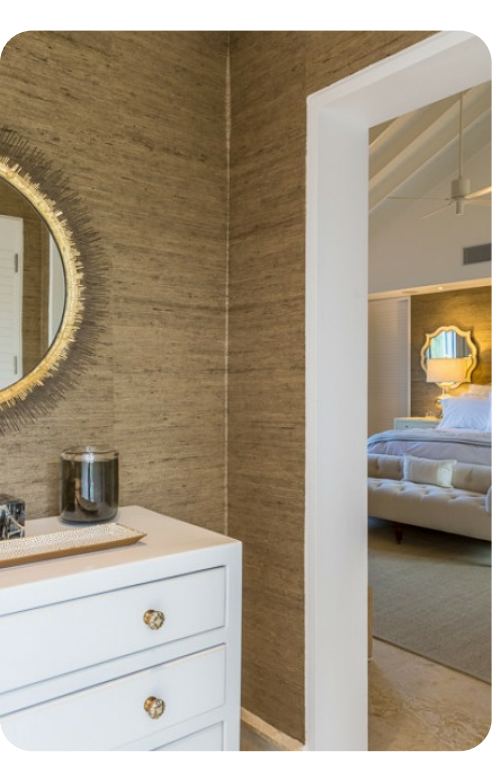
Casa de Campo 12 | Page 3 of 7