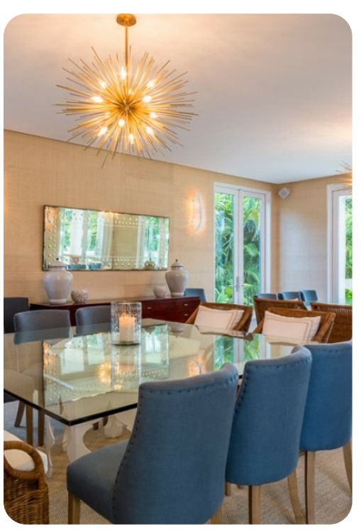
Casa de Campo 12 | Page 2 of 7