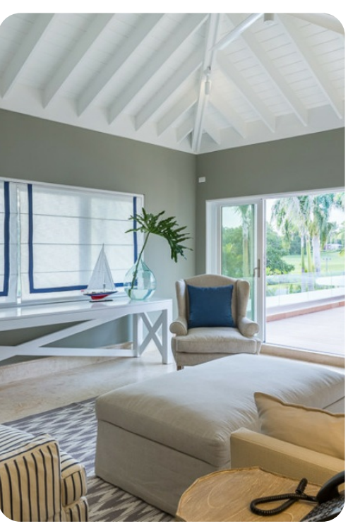
Casa de Campo 12 | Page 5 of 7