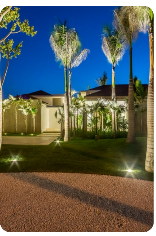
Casa de Campo 12 | Page 7 of 7