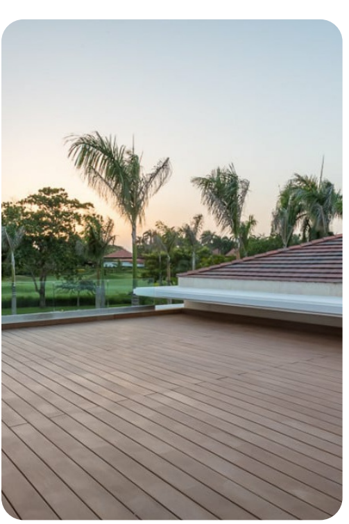
Casa de Campo 12 | Page 6 of 7