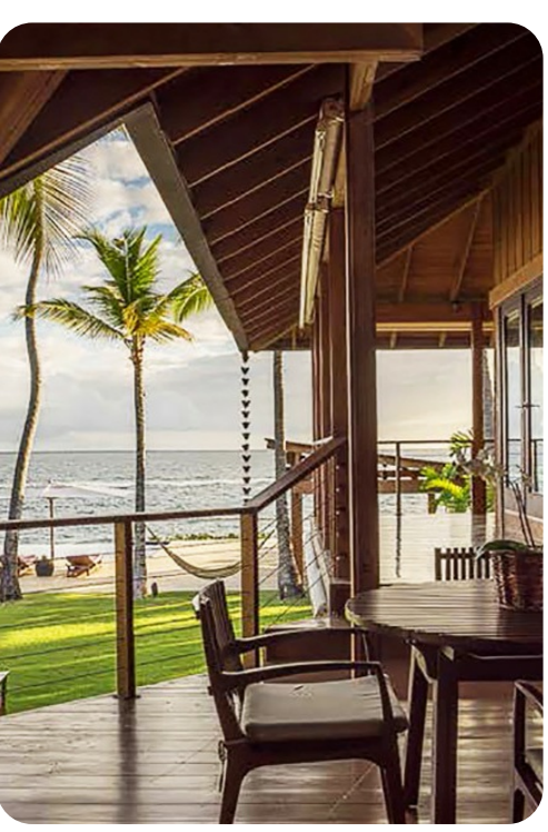
Casa de Campo 108 | Page 5 of 7