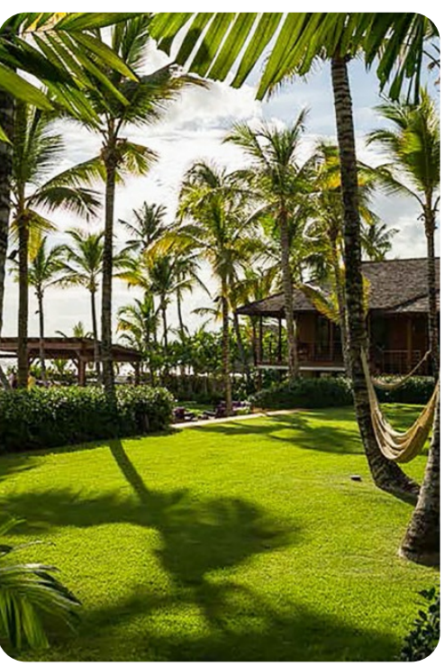
Casa de Campo 108 | Page 6 of 7