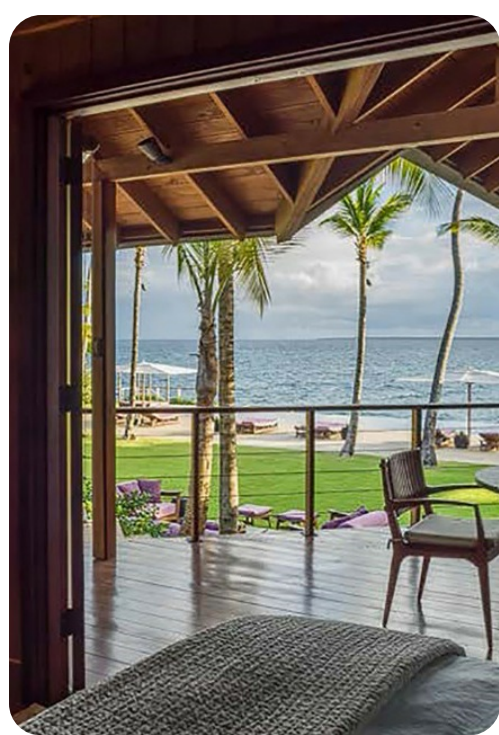
Casa de Campo 108 | Page 4 of 7