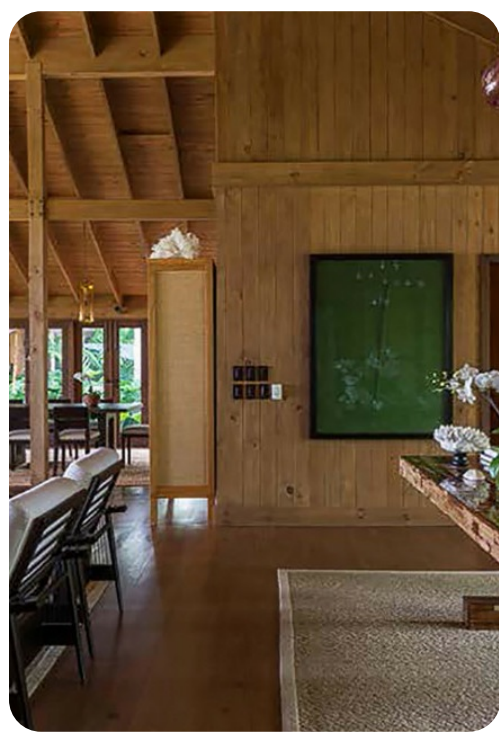
Casa de Campo 108 | Page 2 of 7