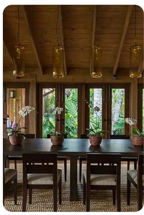
Casa de Campo 108 | Page 3 of 7