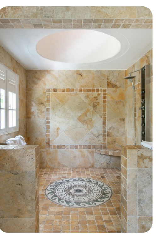
Caribbean Stone | Page 6 of 8