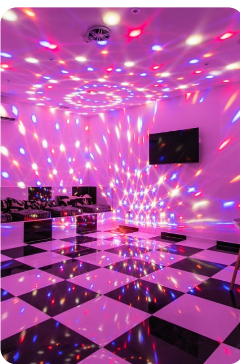
Caribbean Stone | Page 4 of 8