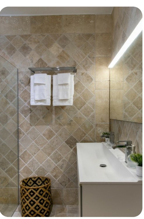
Caribbean Stone | Page 8 of 8