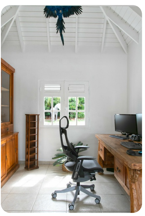
Caribbean Stone | Page 3 of 8