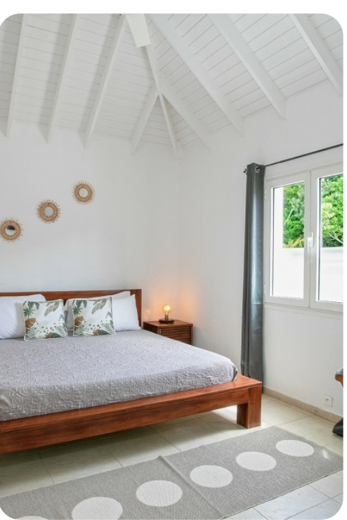
Caribbean Stone | Page 7 of 8