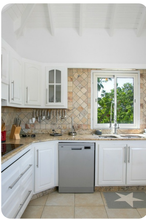
Caribbean Stone | Page 2 of 8