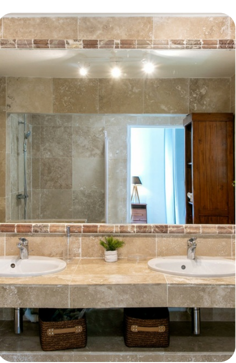
Caribbean Stone | Page 5 of 8