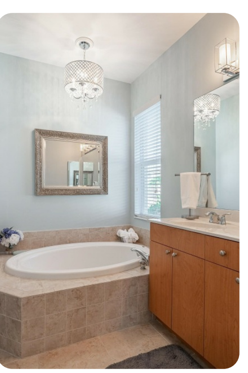
Cape Coral 739 | Page 7 of 8