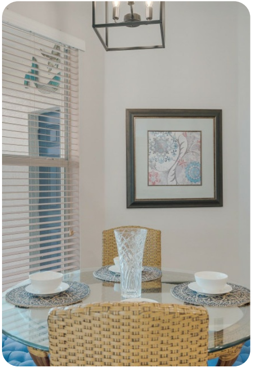
Cape Coral 739 | Page 5 of 8