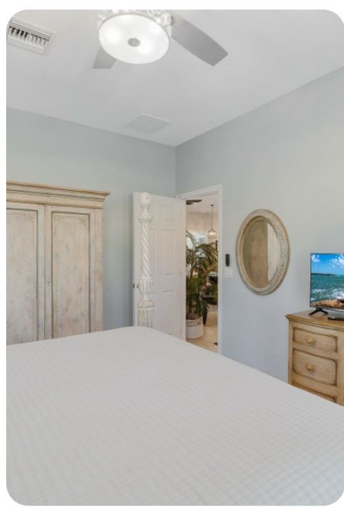
Cape Coral 739 | Page 6 of 8