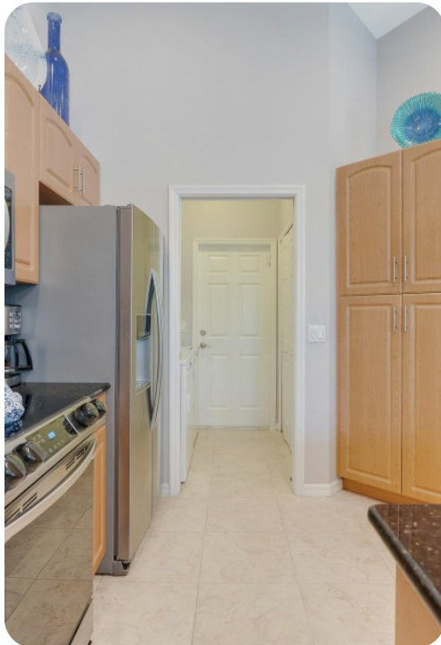
Cape Coral 739 | Page 3 of 8