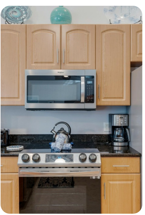
Cape Coral 739 | Page 4 of 8