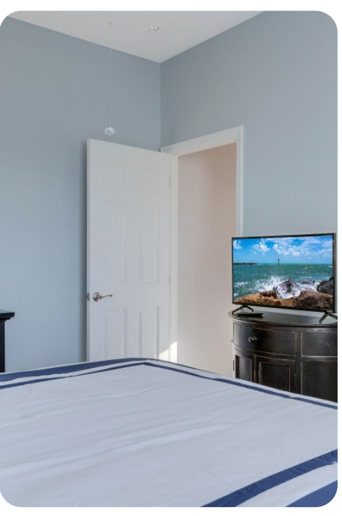
Cape Coral 739 | Page 8 of 8