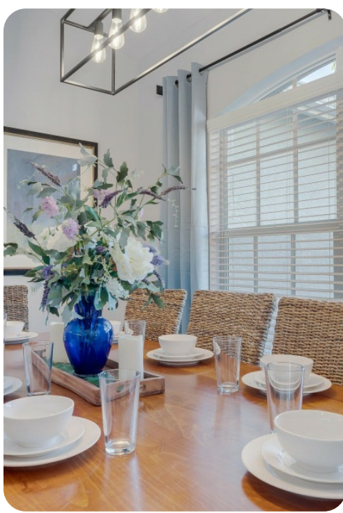
Cape Coral 739 | Page 2 of 8