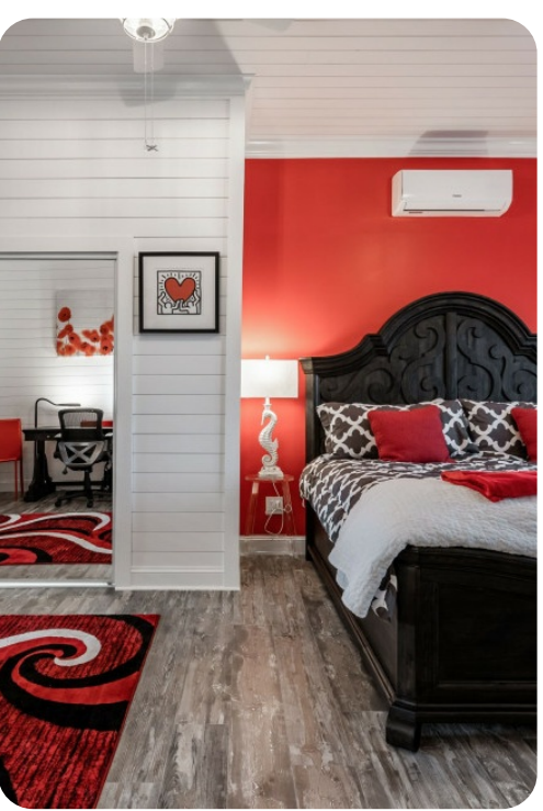
Cape Coral 636 | Page 8 of 8