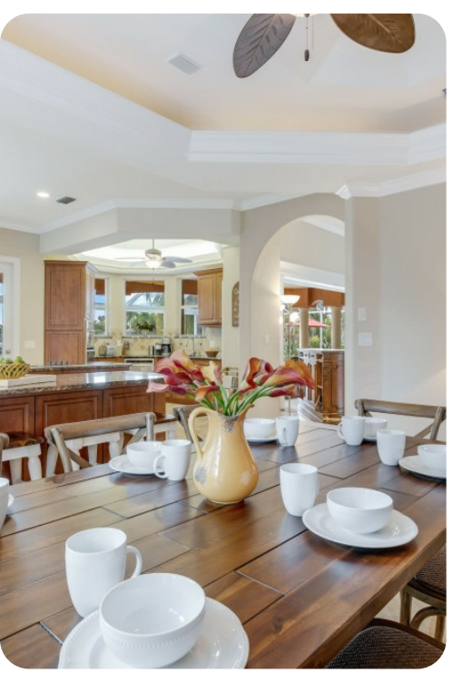
Cape Coral 636 | Page 6 of 8