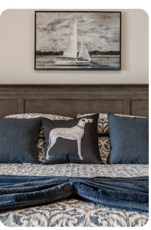
Cape Coral 636 | Page 7 of 8