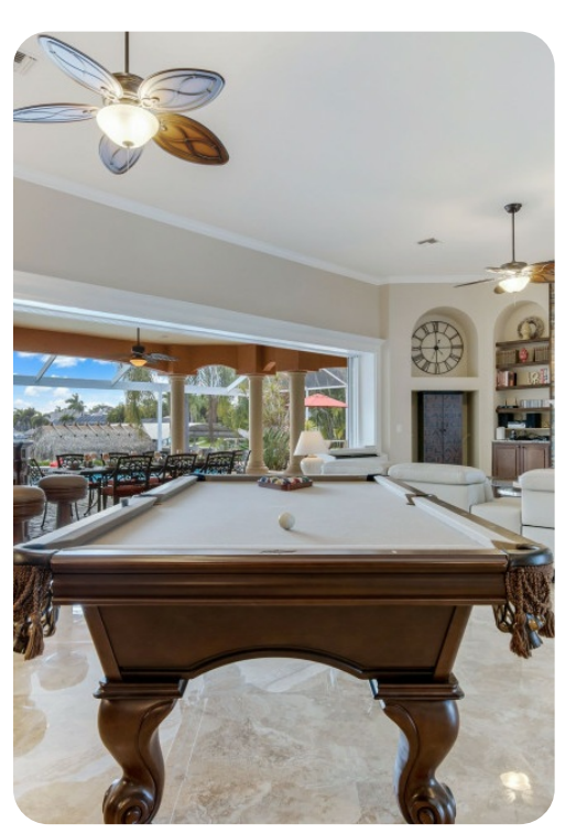
Cape Coral 636 | Page 3 of 8