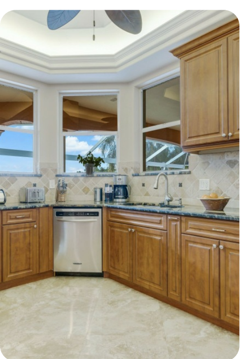
Cape Coral 636 | Page 5 of 8