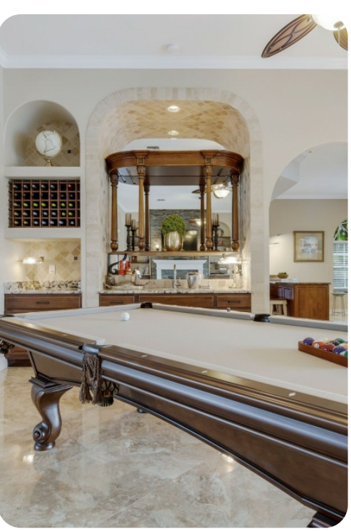
Cape Coral 636 | Page 4 of 8