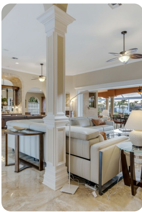
Cape Coral 636 | Page 2 of 8