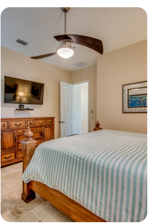
Cape Coral 563 | Page 7 of 8