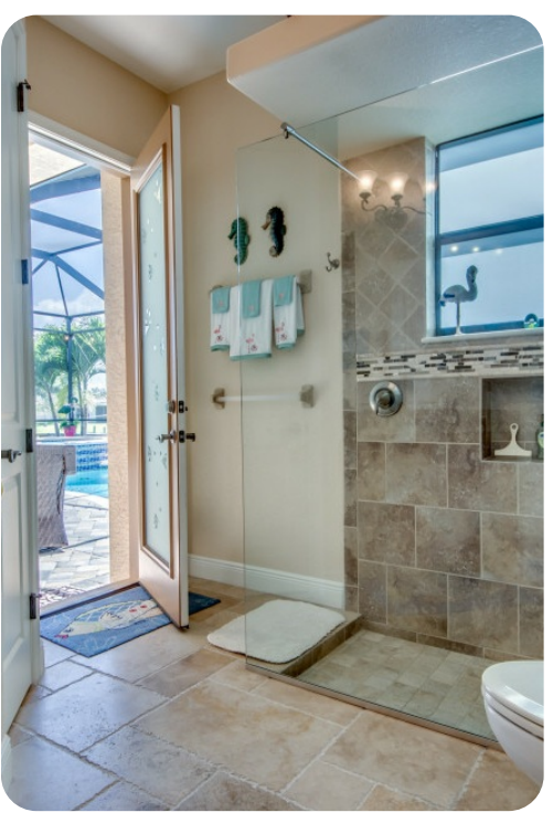
Cape Coral 563 | Page 8 of 8