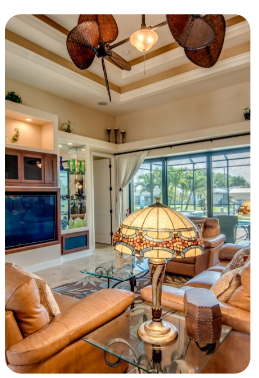
Cape Coral 563 | Page 3 of 8