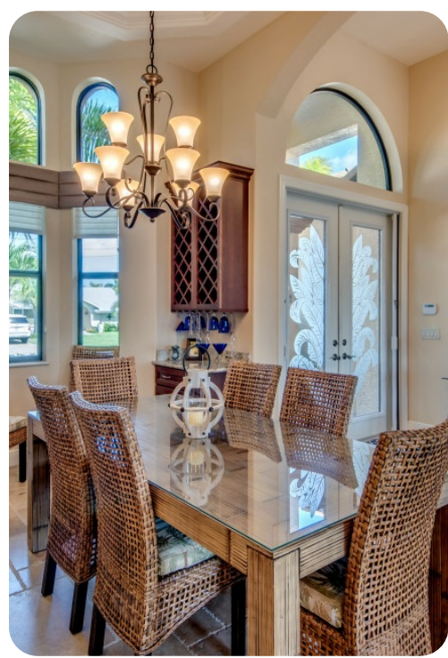
Cape Coral 563 | Page 2 of 8