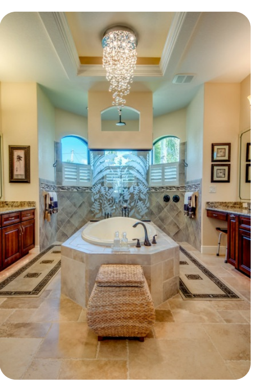
Cape Coral 563 | Page 6 of 8