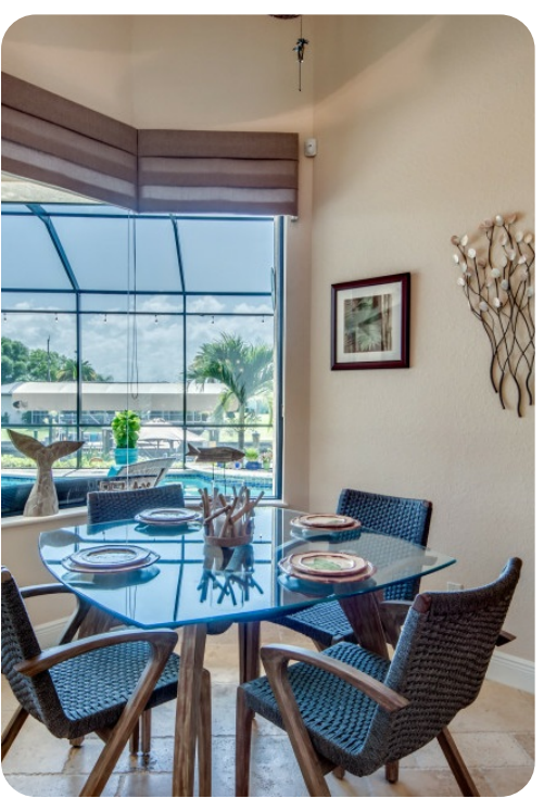
Cape Coral 563 | Page 5 of 8