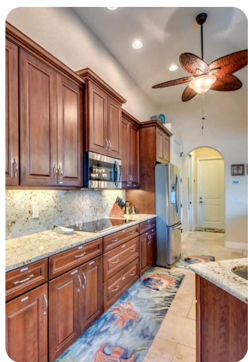
Cape Coral 563 | Page 4 of 8