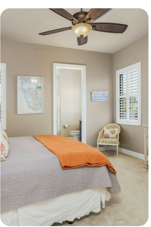
Cape Coral 484 | Page 5 of 8