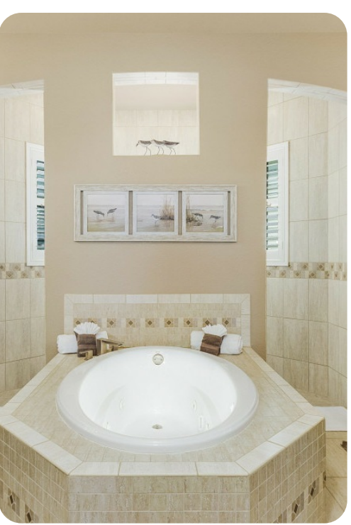
Cape Coral 484 | Page 4 of 8