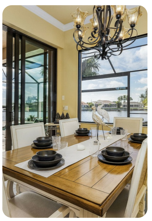
Cape Coral 484 | Page 3 of 8