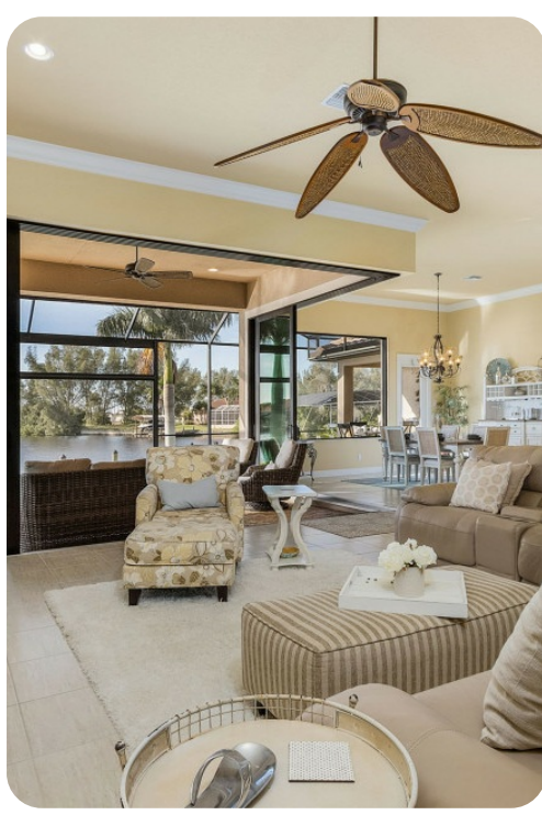
Cape Coral 484 | Page 2 of 8