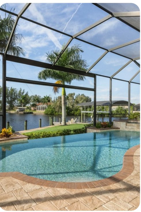
Cape Coral 484 | Page 7 of 8