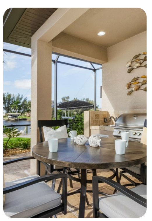
Cape Coral 484 | Page 8 of 8