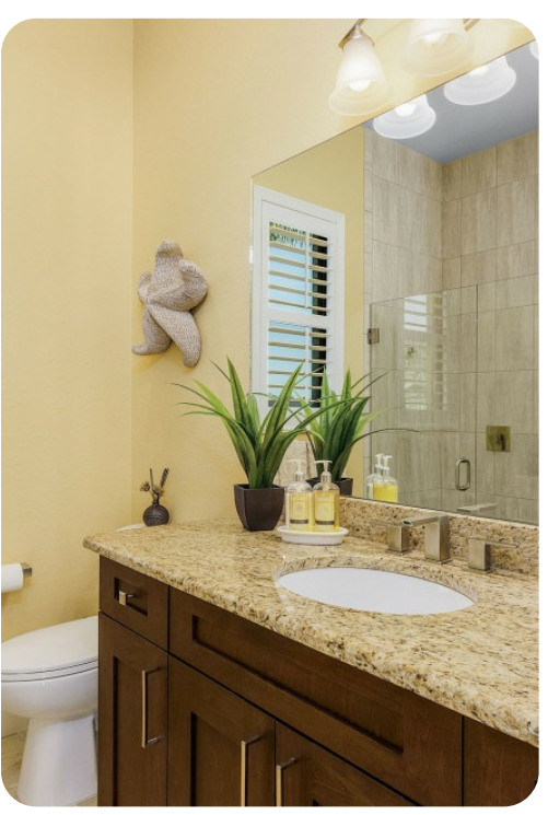
Cape Coral 484 | Page 6 of 8