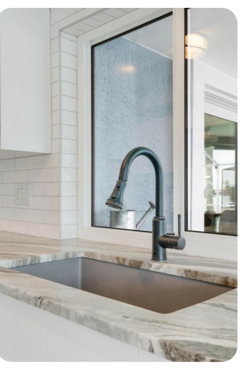
Cape Coral 446 | Page 4 of 8