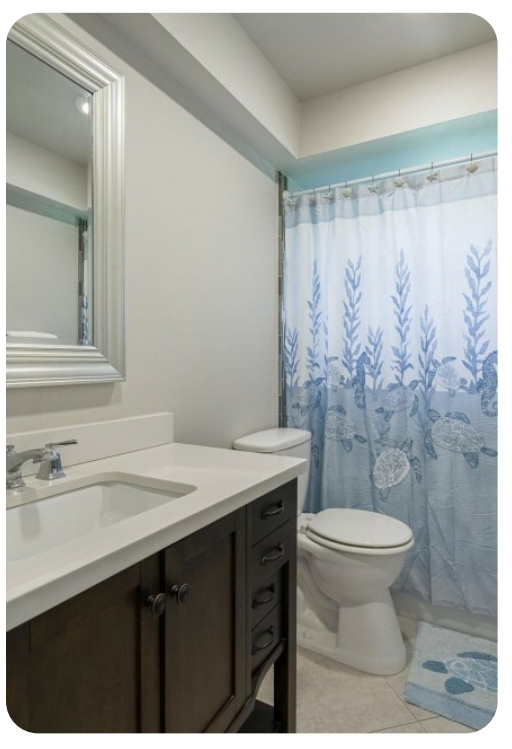
Cape Coral 446 | Page 6 of 8