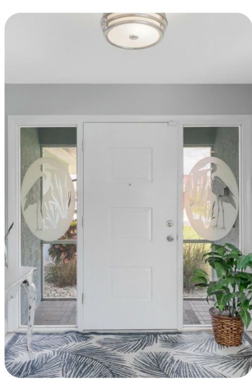
Cape Coral 446 | Page 2 of 8