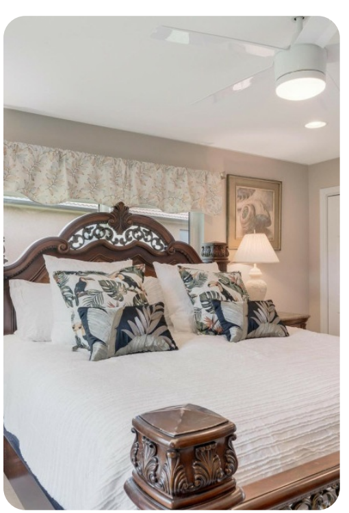
Cape Coral 446 | Page 7 of 8