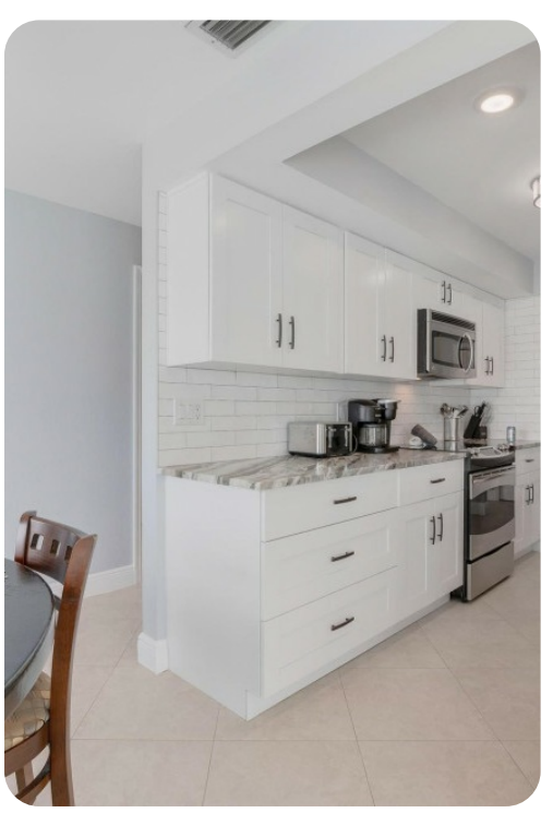
Cape Coral 446 | Page 5 of 8