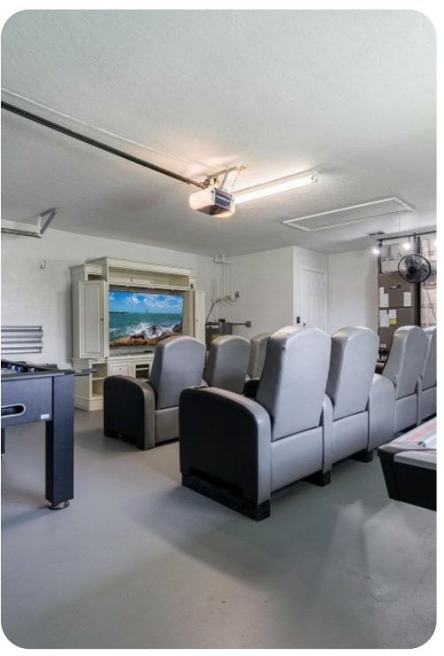
Cape Coral 446 | Page 8 of 8