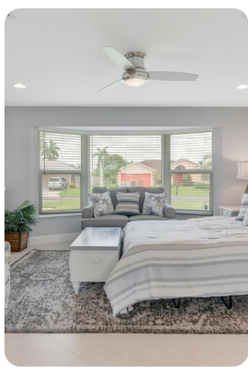
Cape Coral 446 | Page 3 of 8