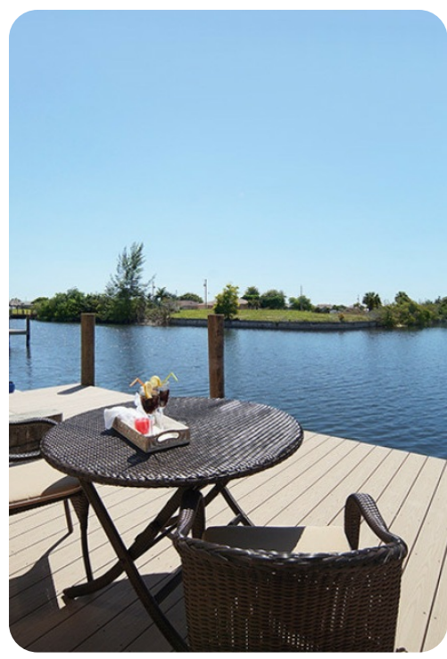
Cape Coral 136 | Page 4 of 7