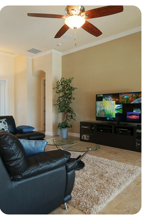
Cape Coral 136 | Page 6 of 7