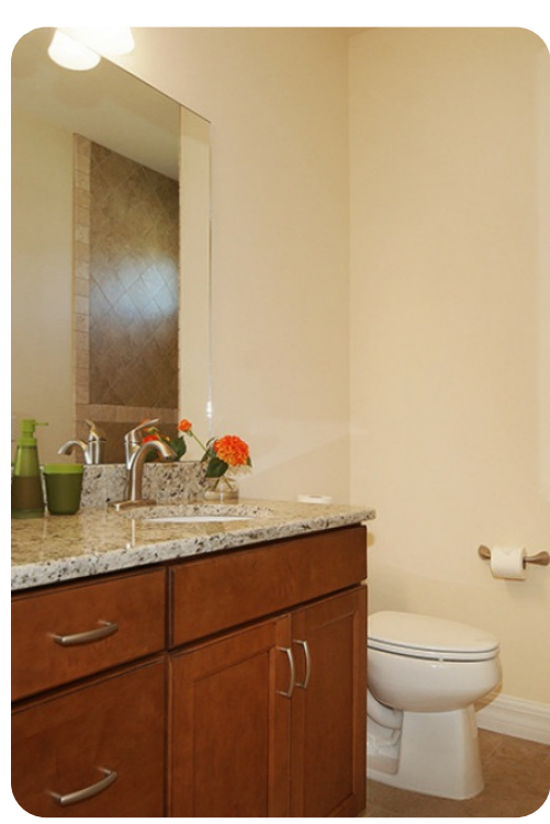
Cape Coral 136 | Page 3 of 7