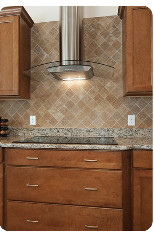
Cape Coral 136 | Page 5 of 7