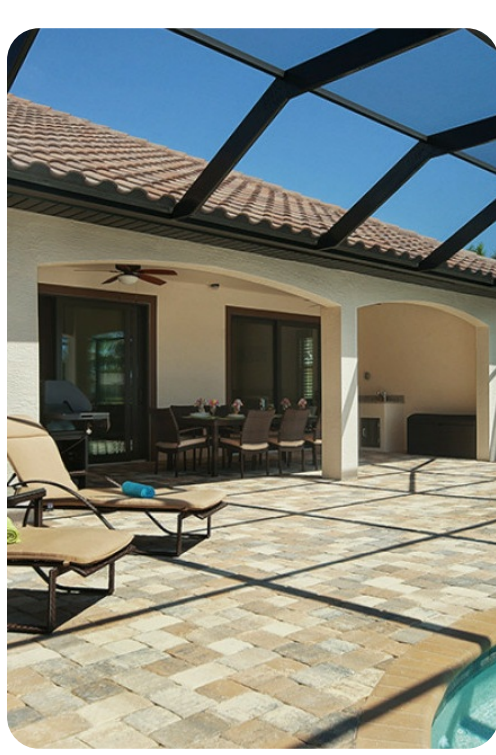
Cape Coral 136 | Page 2 of 7