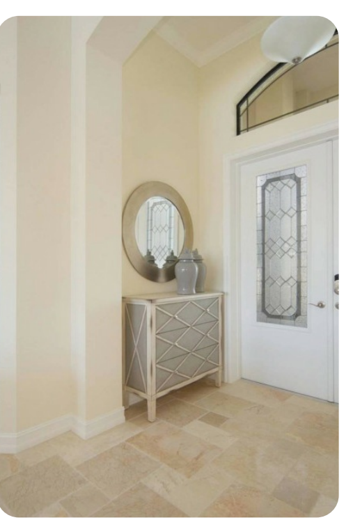
Cape Coral 132 | Page 6 of 8