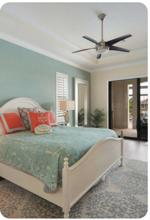
Cape Coral 132 | Page 8 of 8