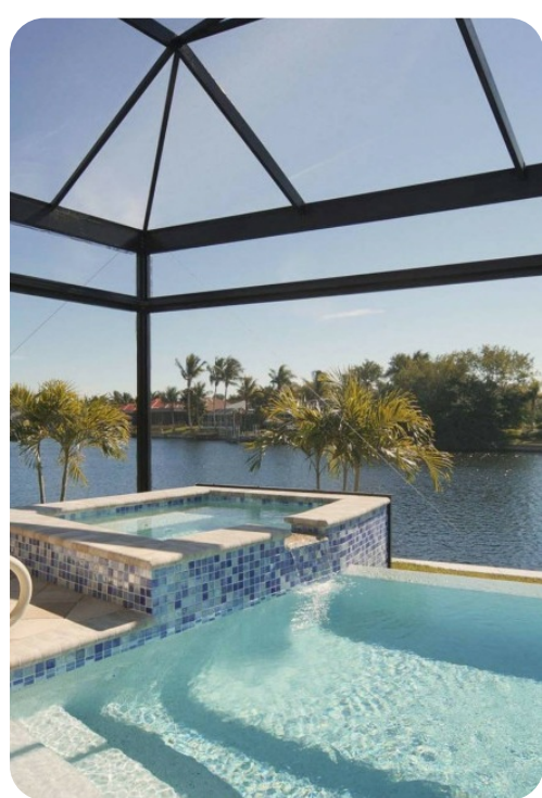
Cape Coral 132 | Page 3 of 8