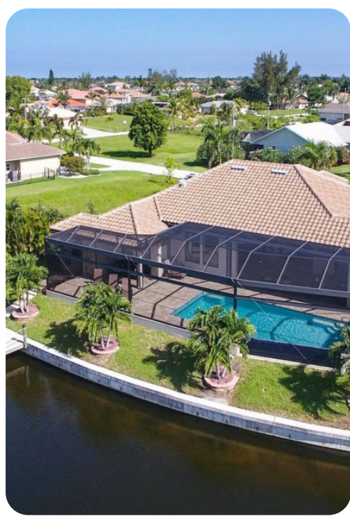
Cape Coral 132 | Page 4 of 8