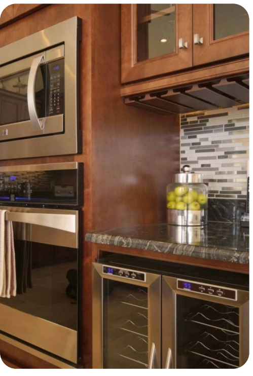
Cape Coral 132 | Page 7 of 8