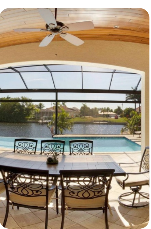
Cape Coral 132 | Page 5 of 8