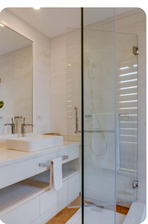
Cap Cana 12 | Page 5 of 6