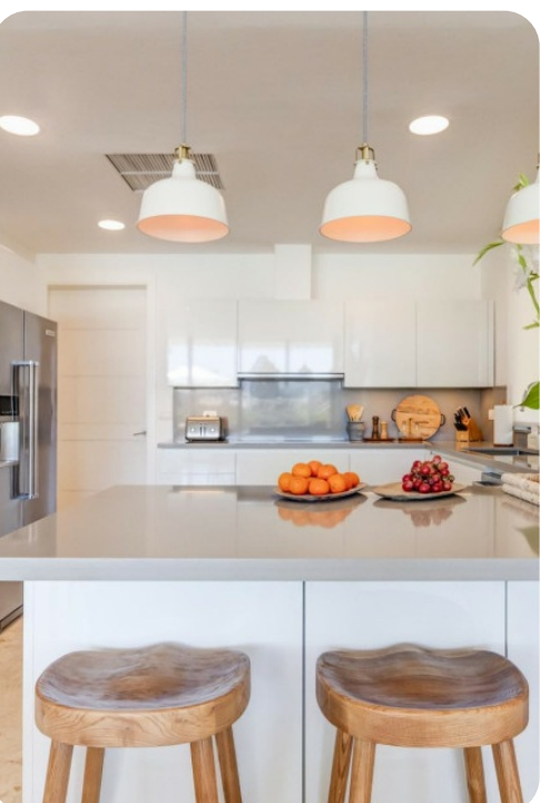
Cap Cana 12 | Page 3 of 6