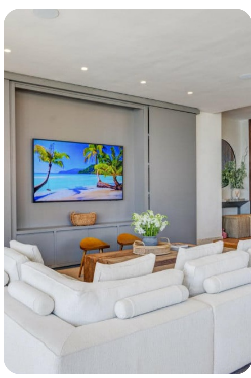
Cap Cana 12 | Page 2 of 6