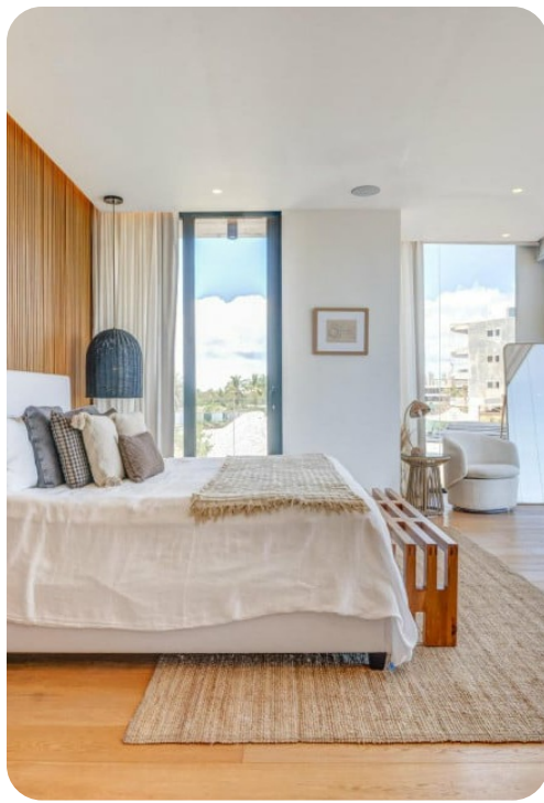
Cap Cana 12 | Page 4 of 6