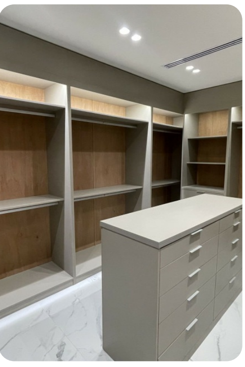
Cap Cana 100 | Page 6 of 8