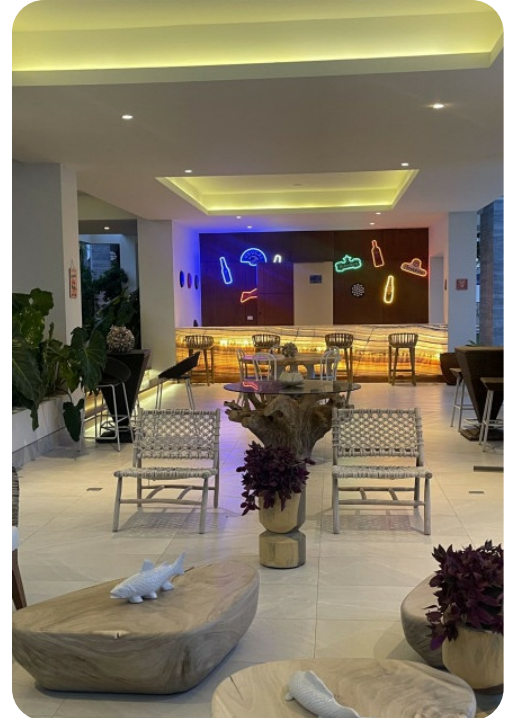
Cap Cana 100 | Page 4 of 8