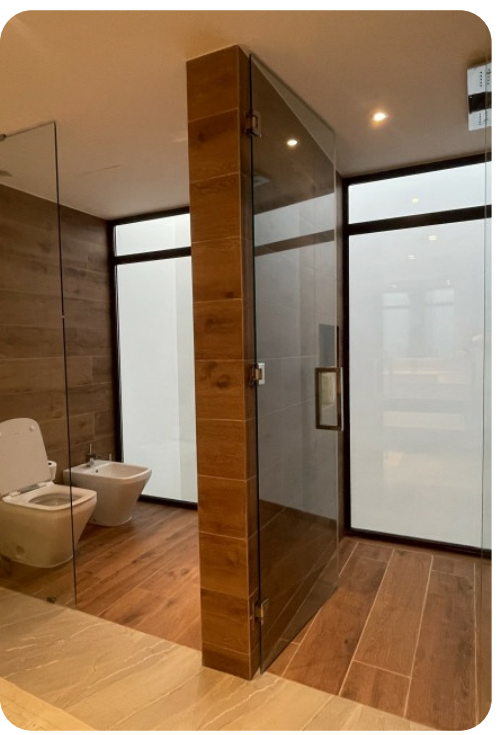
Cap Cana 100 | Page 7 of 8