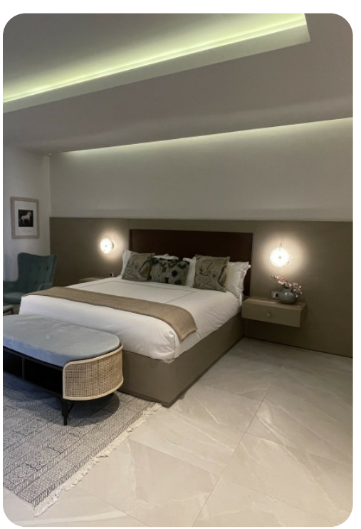
Cap Cana 100 | Page 8 of 8