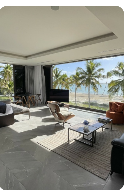
Cap Cana 100 | Page 5 of 8