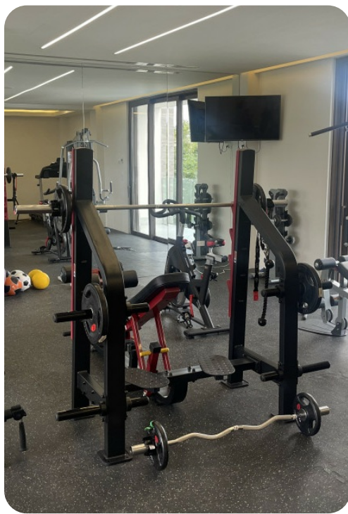
Cap Cana 100 | Page 3 of 8