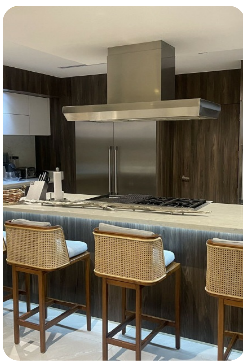
Cap Cana 100 | Page 2 of 8