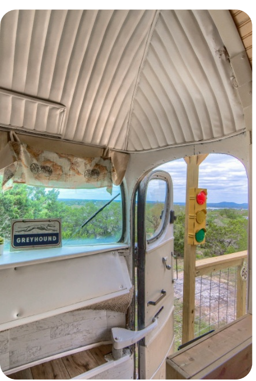
Canyon Lake 9 | Page 8 of 8