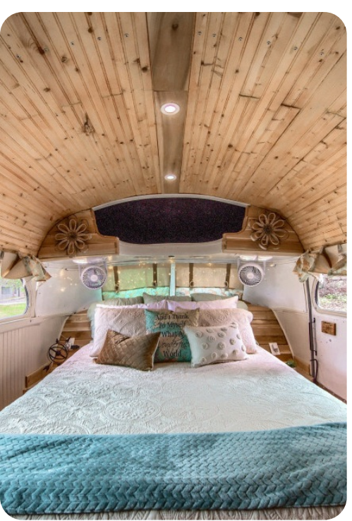
Canyon Lake 9 | Page 4 of 8