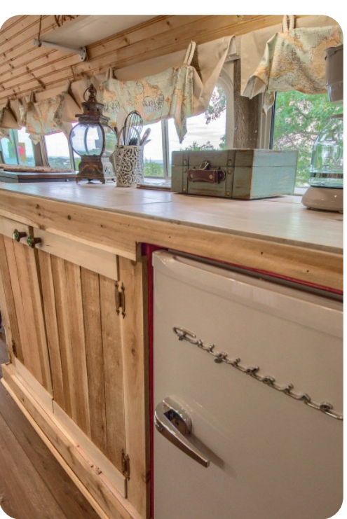
Canyon Lake 9 | Page 2 of 8