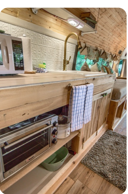
Canyon Lake 9 | Page 3 of 8