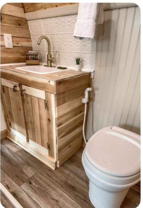
Canyon Lake 9 | Page 5 of 8