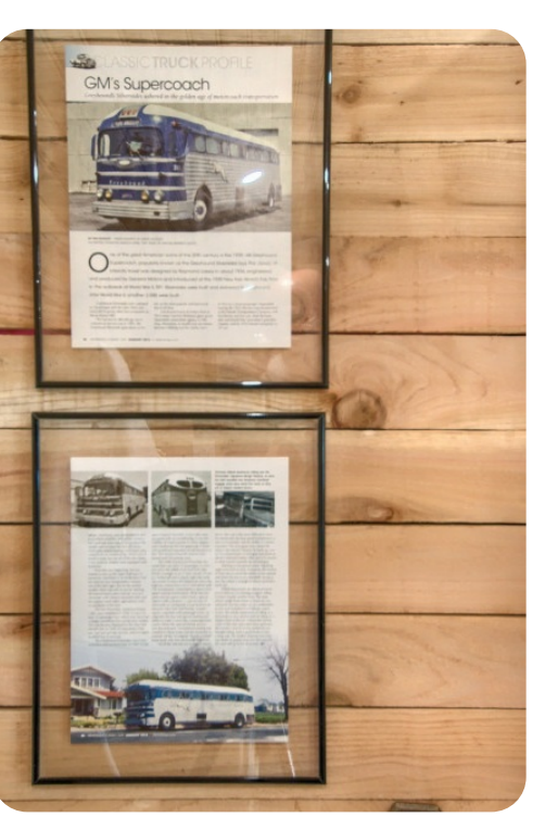
Canyon Lake 9 | Page 6 of 8