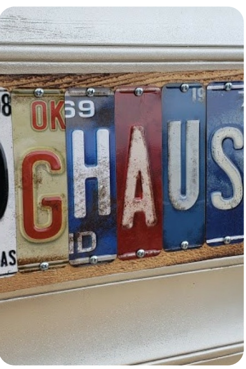
Canyon Lake 9 | Page 7 of 8