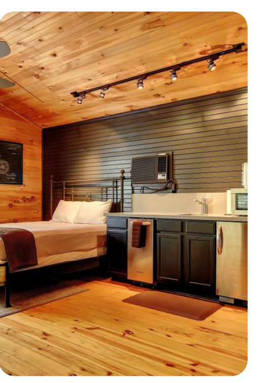
Canyon Lake 35 | Page 6 of 8