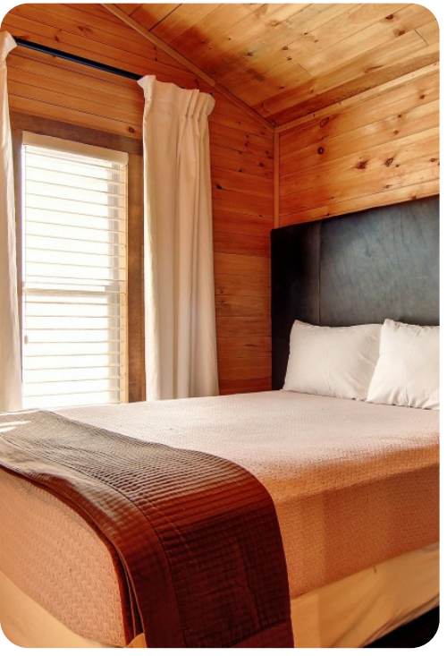
Canyon Lake 35 | Page 3 of 8