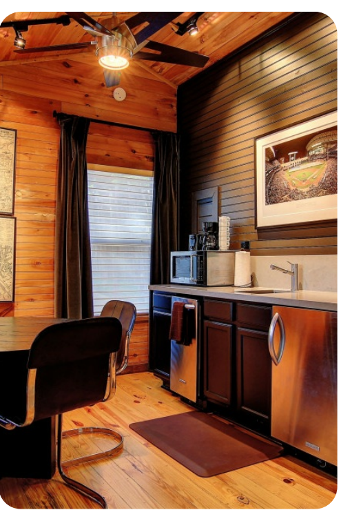
Canyon Lake 35 | Page 4 of 8