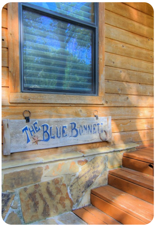
Canyon Lake 35 | Page 7 of 8