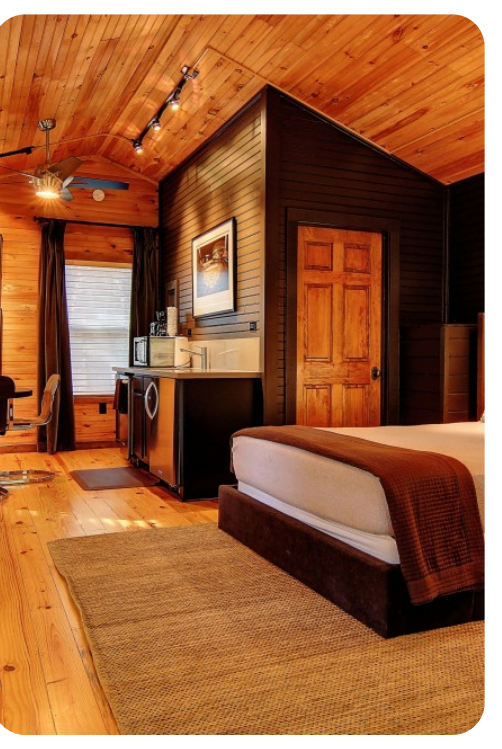
Canyon Lake 35 | Page 5 of 8