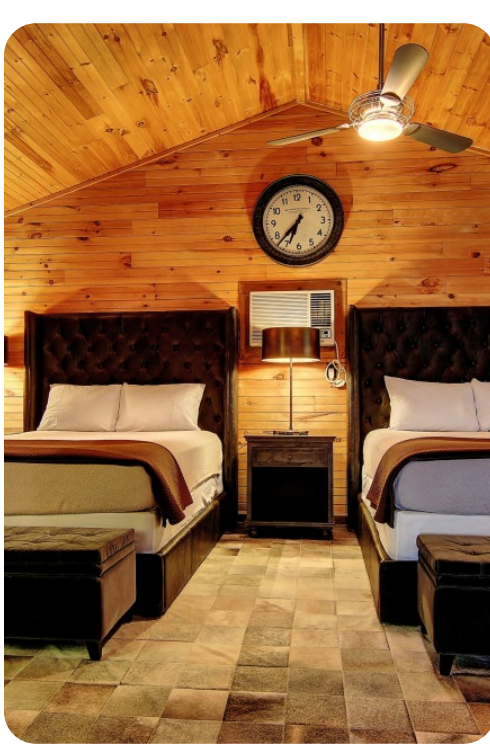
Canyon Lake 35 | Page 2 of 8