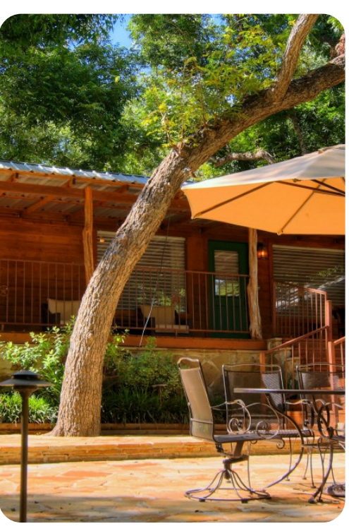
Canyon Lake 35 | Page 8 of 8