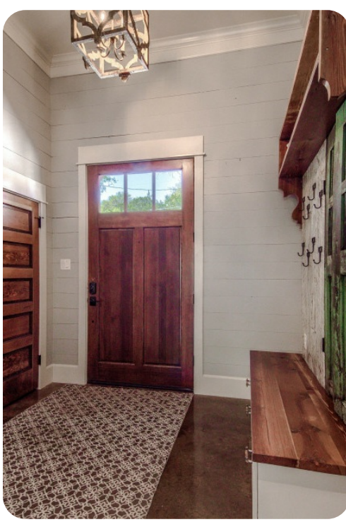
Canyon Lake 20 | Page 2 of 8