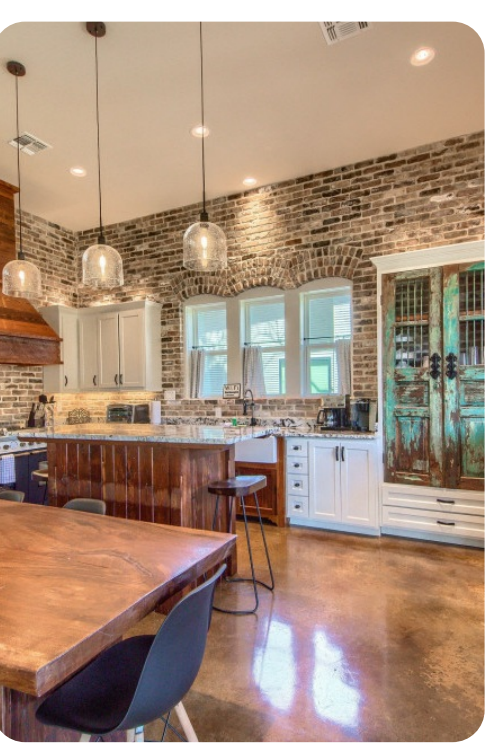
Canyon Lake 20 | Page 3 of 8