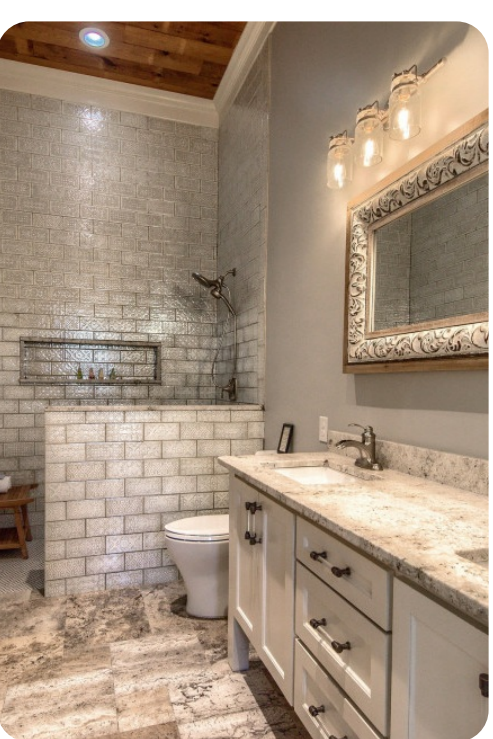
Canyon Lake 20 | Page 5 of 8