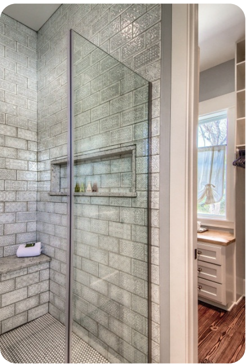
Canyon Lake 20 | Page 7 of 8