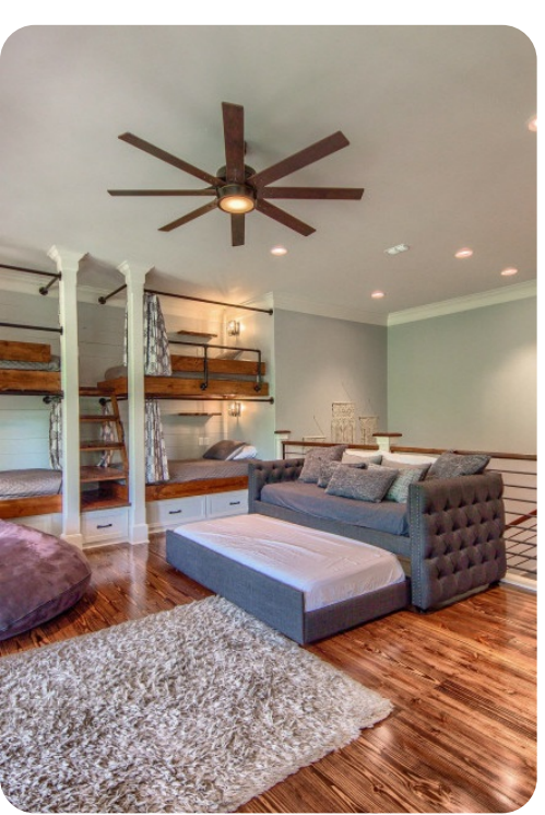
Canyon Lake 20 | Page 6 of 8