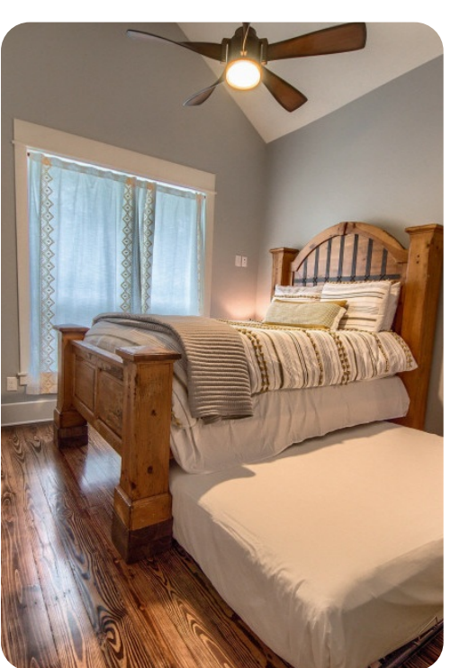
Canyon Lake 20 | Page 8 of 8