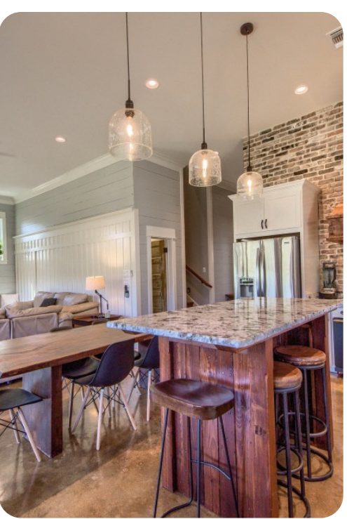
Canyon Lake 20 | Page 4 of 8