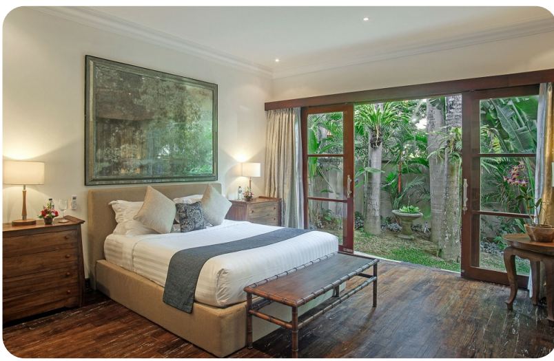
Canggu 1606 - Avalon III | Page 1 of 4