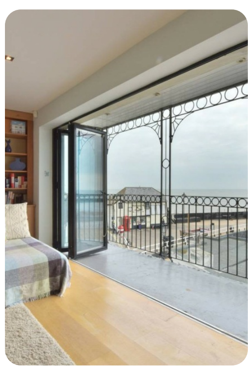
Broadstairs 4 | Page 2 of 6