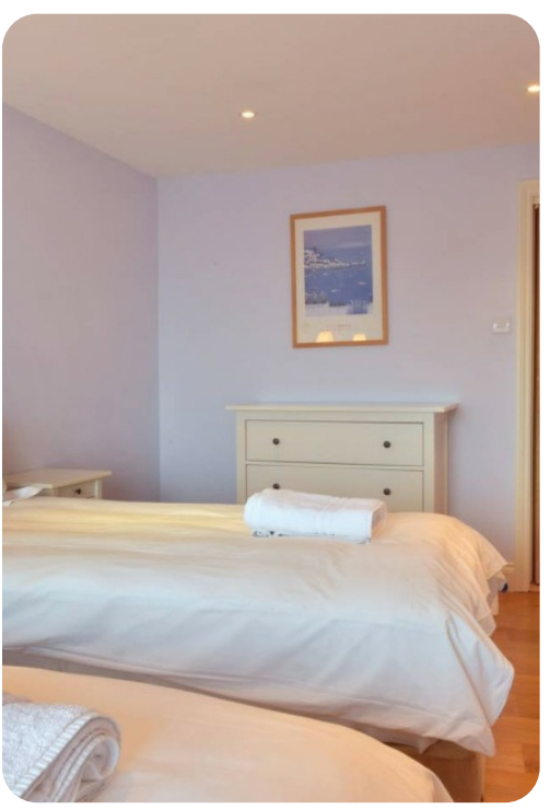
Broadstairs 4 | Page 3 of 6