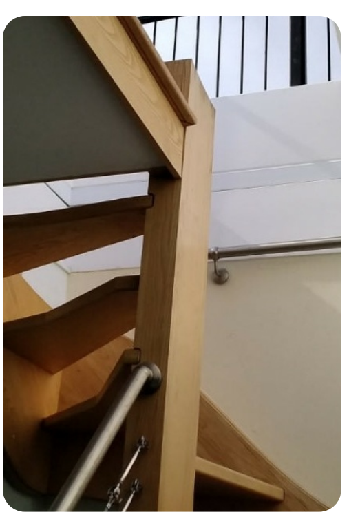
Broadstairs 4 | Page 4 of 6