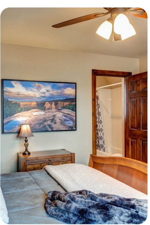
Breckenridge 9 | Page 6 of 8