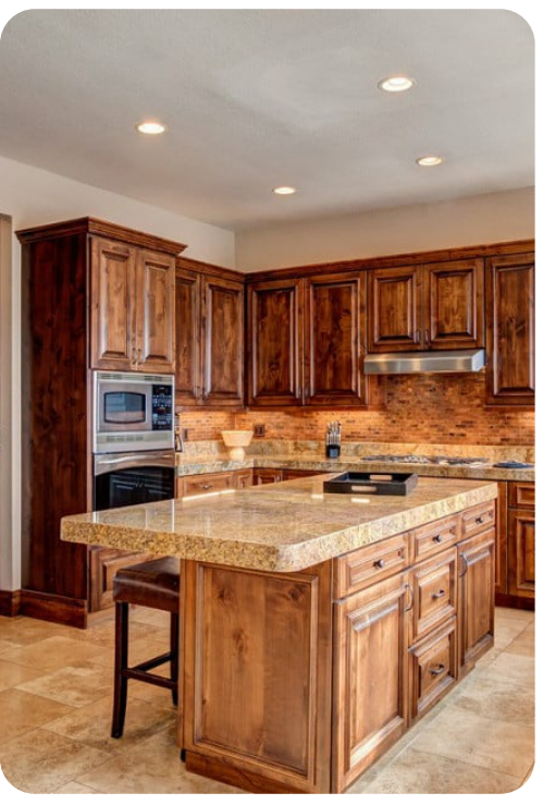
Breckenridge 9 | Page 2 of 8