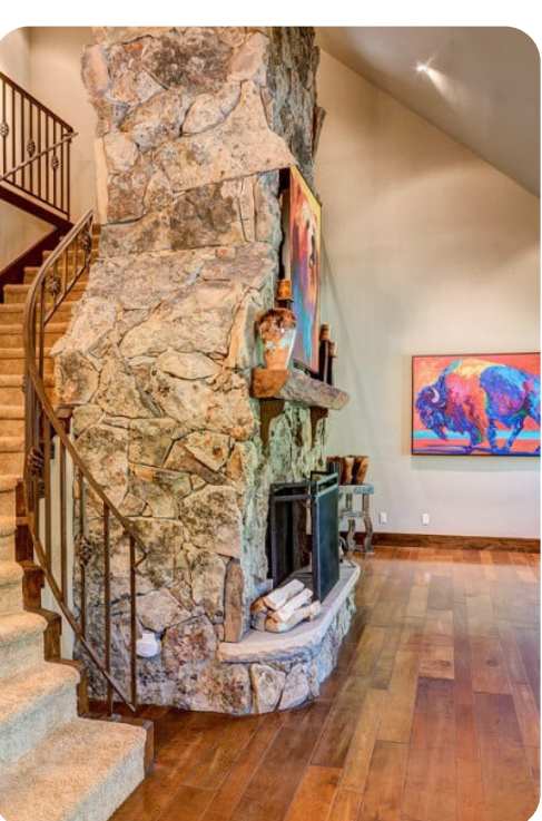
Breckenridge 9 | Page 3 of 8