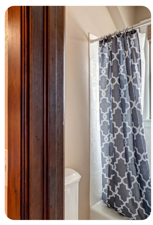
Breckenridge 9 | Page 8 of 8