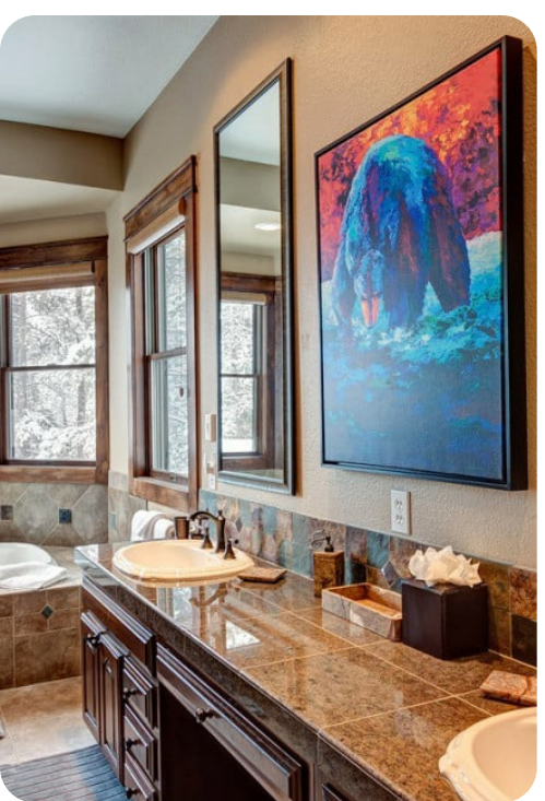
Breckenridge 9 | Page 4 of 8