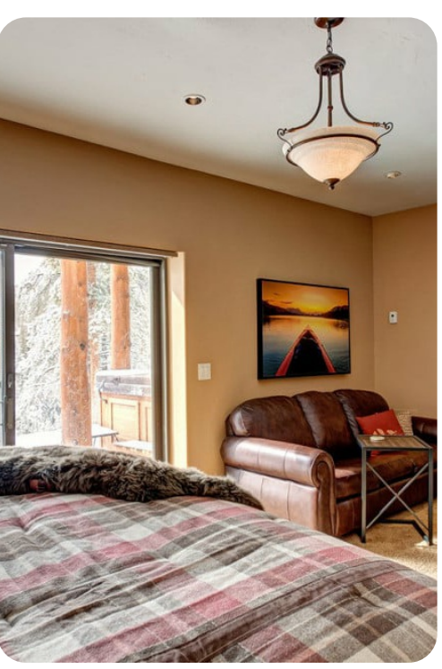
Breckenridge 9 | Page 5 of 8