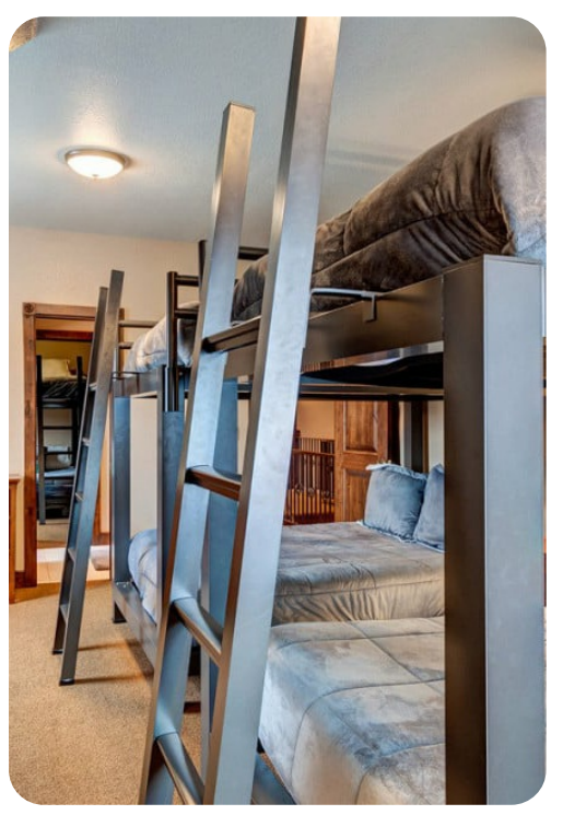
Breckenridge 9 | Page 7 of 8