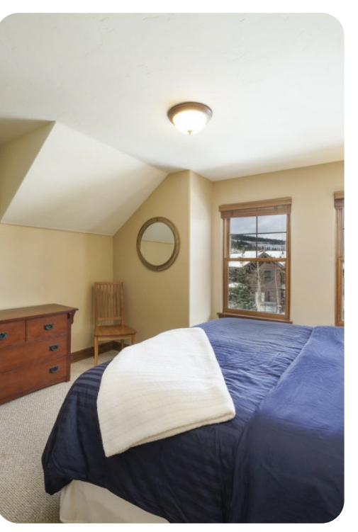
Breckenridge 36 | Page 7 of 8