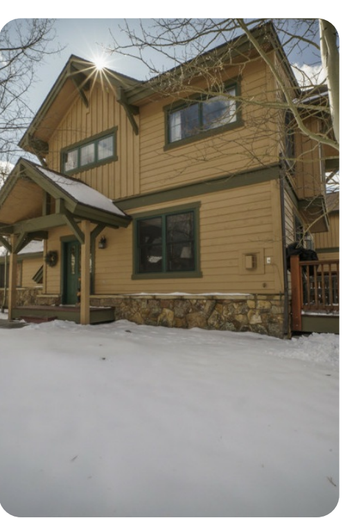
Breckenridge 36 | Page 5 of 8