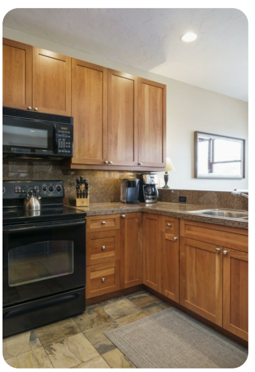
Breckenridge 36 | Page 2 of 8