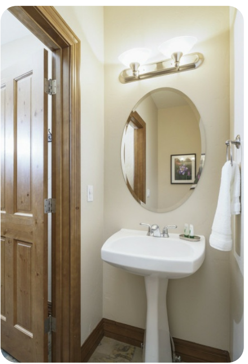
Breckenridge 36 | Page 6 of 8