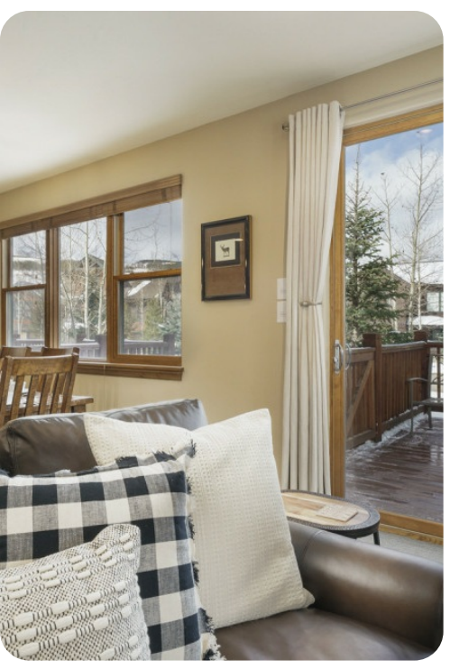
Breckenridge 36 | Page 4 of 8