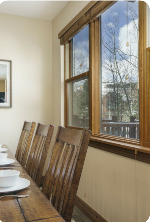
Breckenridge 36 | Page 3 of 8