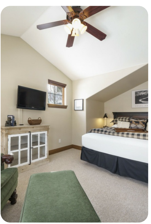
Breckenridge 36 | Page 8 of 8