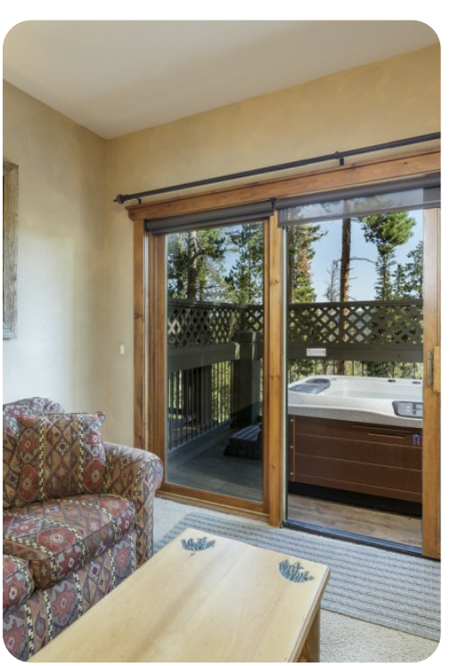
Breckenridge 35 | Page 3 of 8