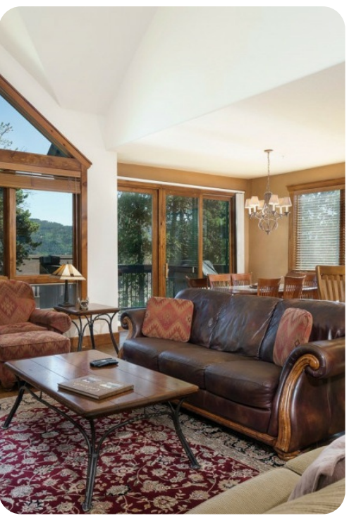
Breckenridge 35 | Page 4 of 8