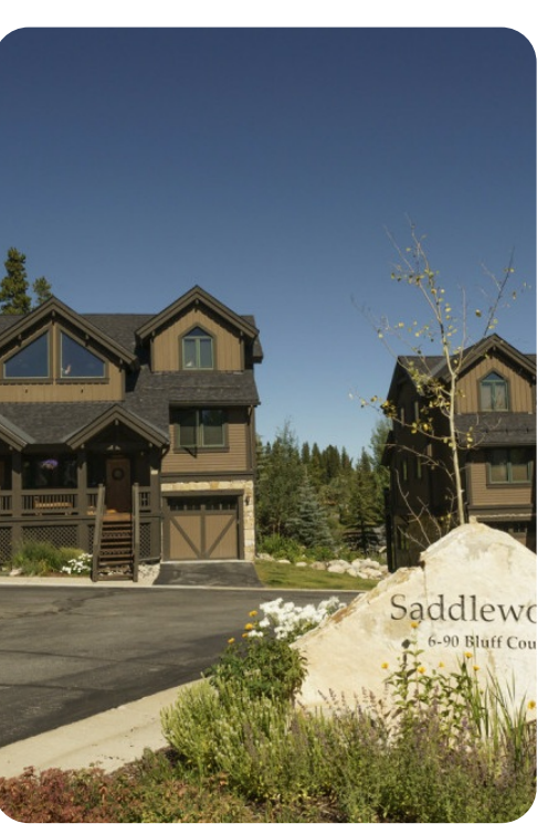
Breckenridge 35 | Page 8 of 8