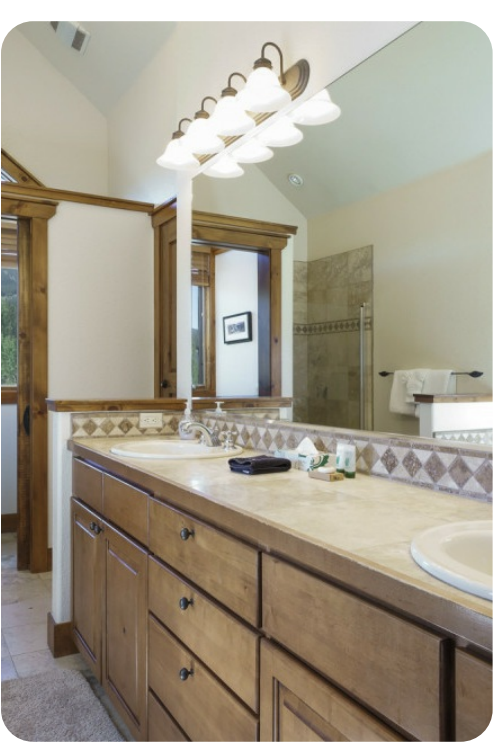
Breckenridge 35 | Page 7 of 8