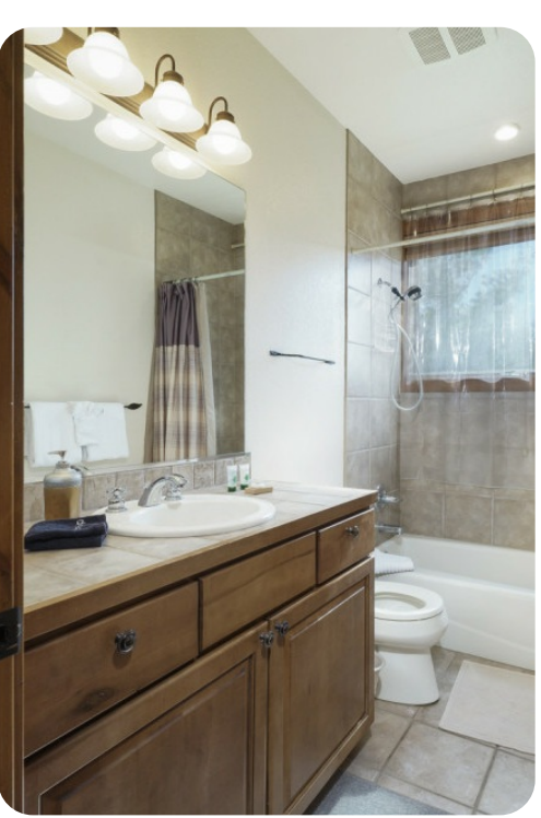
Breckenridge 35 | Page 6 of 8