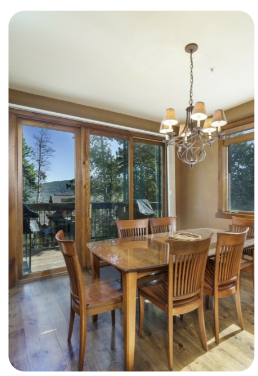
Breckenridge 35 | Page 5 of 8