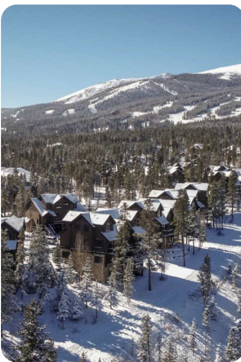
Breckenridge 35 | Page 2 of 8