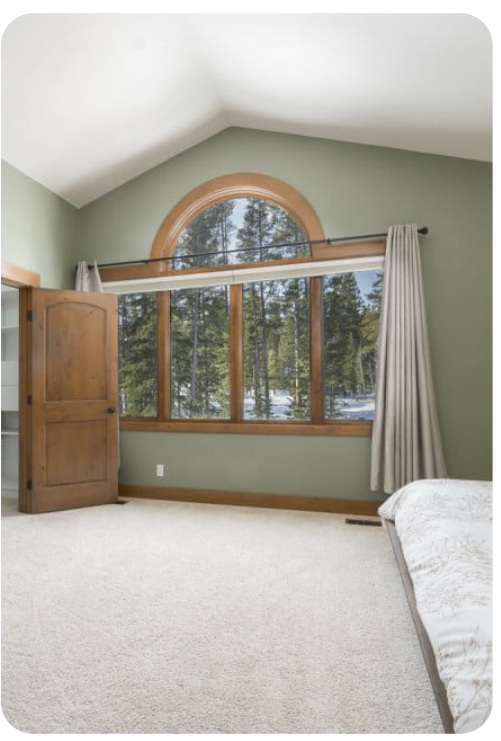
Breckenridge 28 | Page 7 of 8