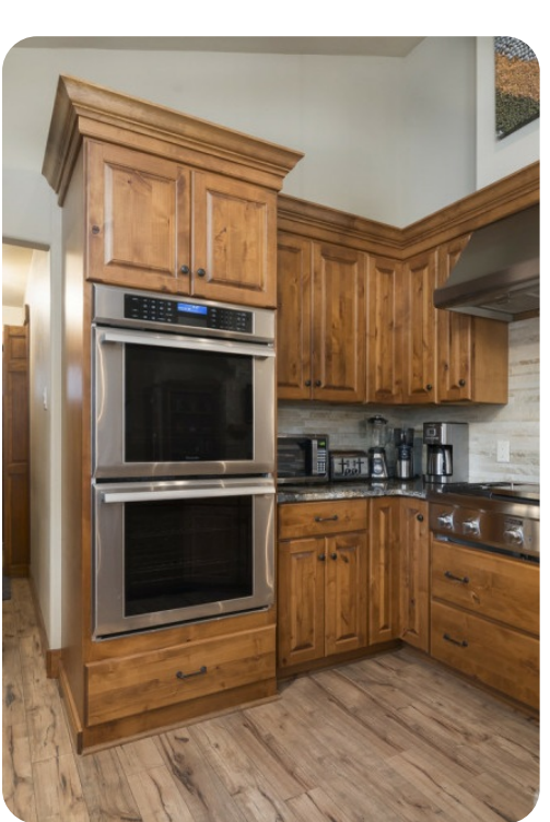
Breckenridge 28 | Page 2 of 8