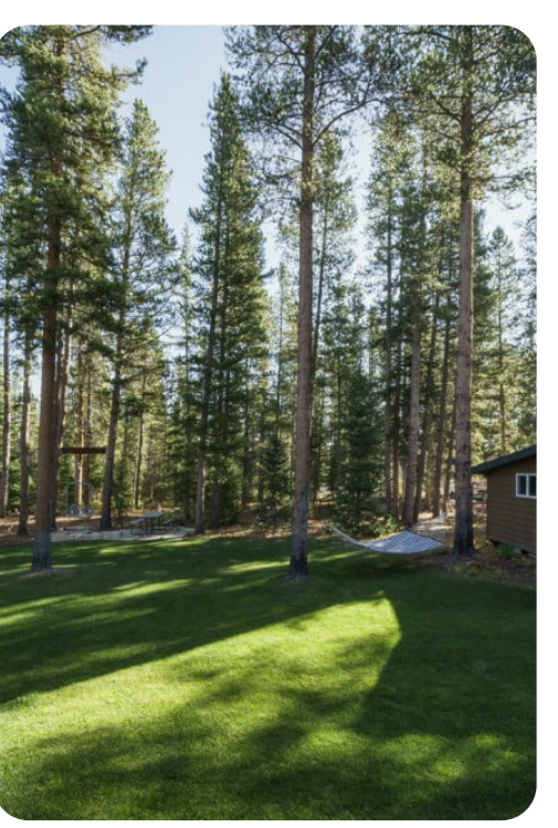
Breckenridge 28 | Page 8 of 8