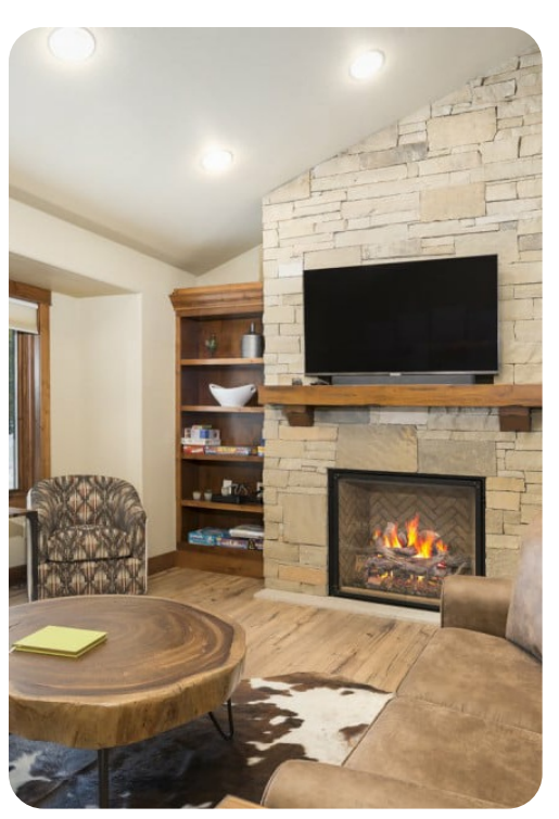
Breckenridge 28 | Page 4 of 8