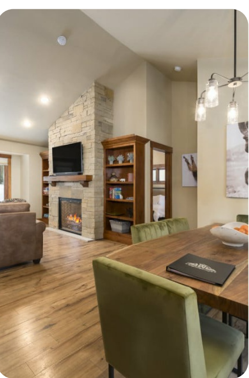
Breckenridge 28 | Page 3 of 8