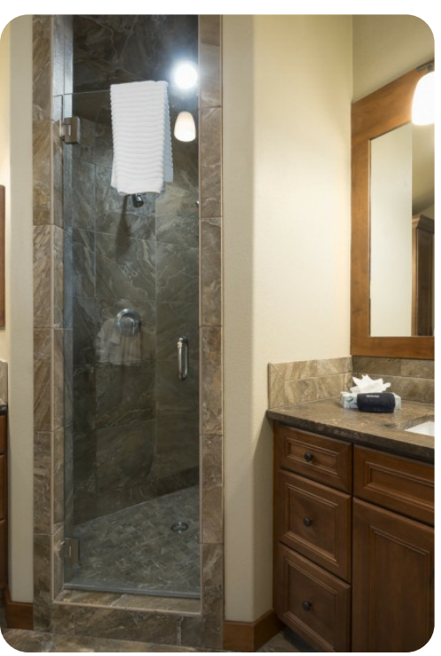
Breckenridge 28 | Page 5 of 8