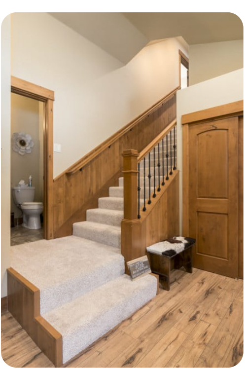
Breckenridge 28 | Page 6 of 8