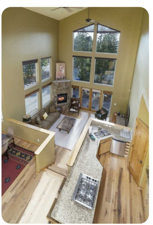
Breckenridge 25 | Page 7 of 8