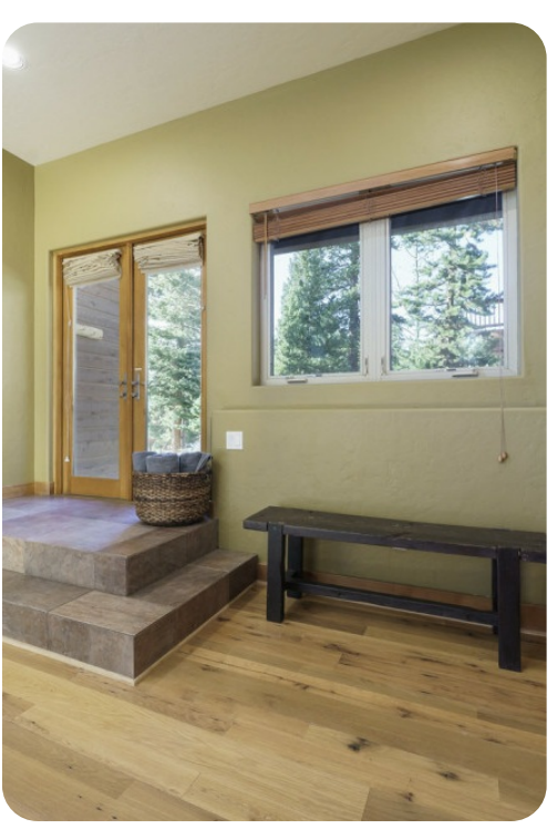
Breckenridge 25 | Page 5 of 8