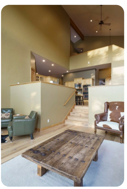
Breckenridge 25 | Page 2 of 8