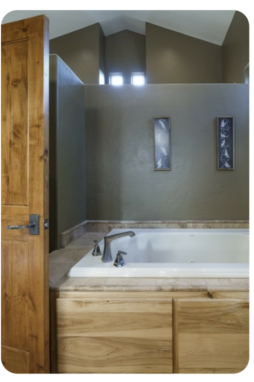
Breckenridge 25 | Page 4 of 8