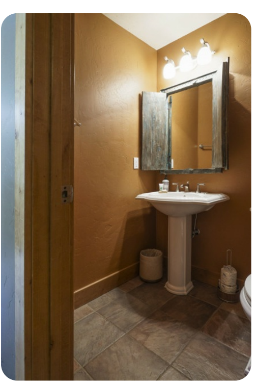
Breckenridge 25 | Page 6 of 8