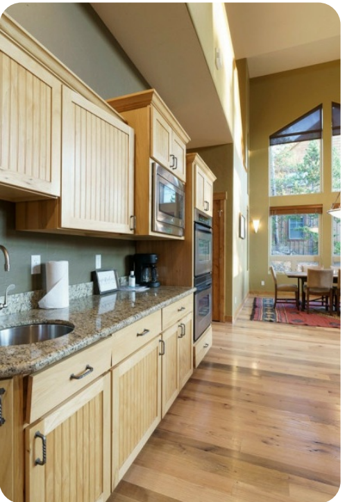
Breckenridge 25 | Page 3 of 8