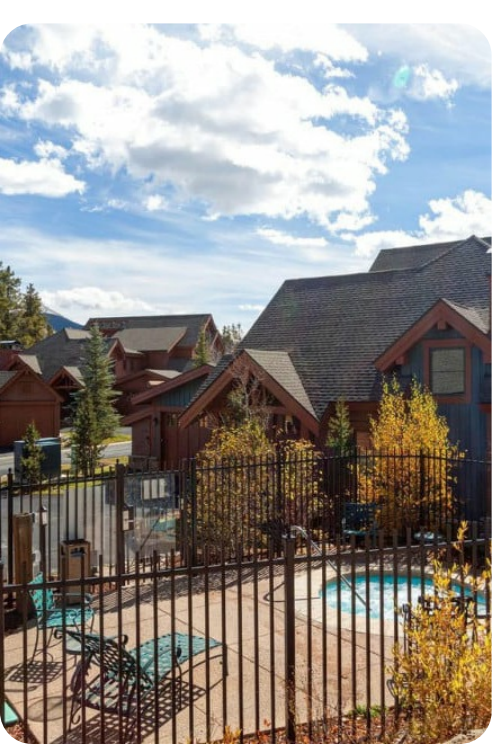
Breckenridge 23 | Page 5 of 5