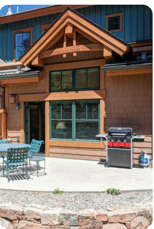
Breckenridge 23 | Page 4 of 5