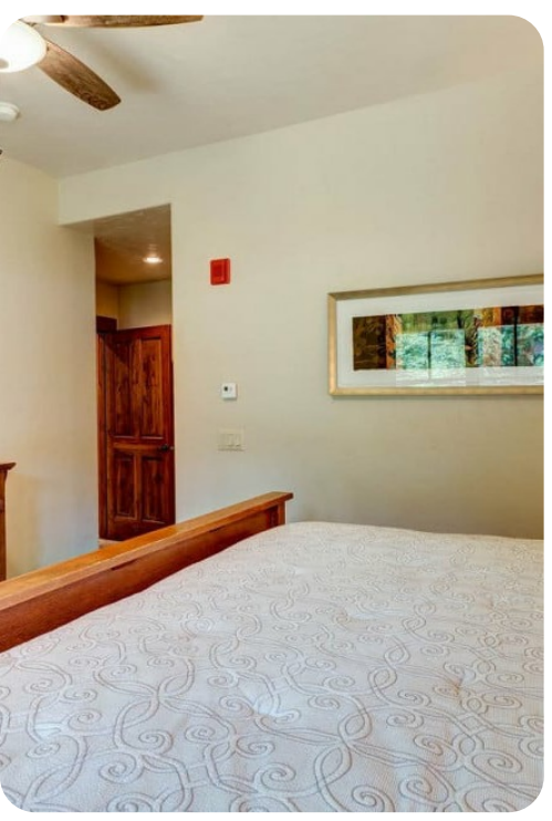
Breckenridge 23 | Page 3 of 5