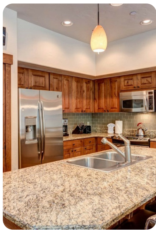
Breckenridge 23 | Page 2 of 5