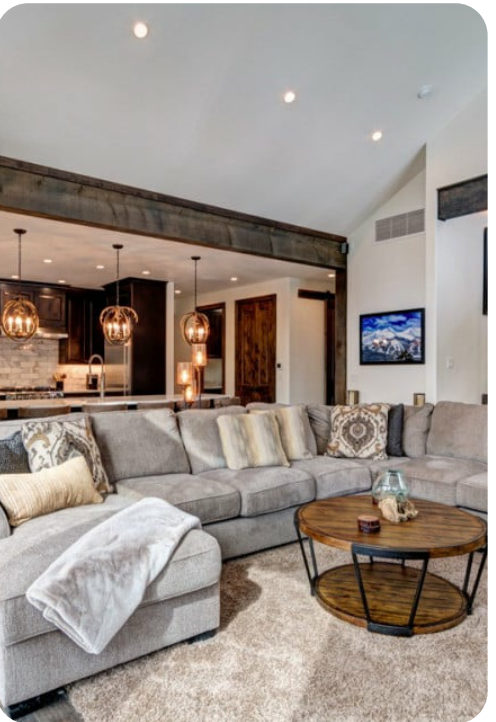
Breckenridge 16 | Page 2 of 8