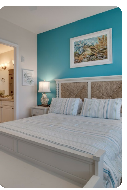
Bradenton 62 | Page 4 of 8