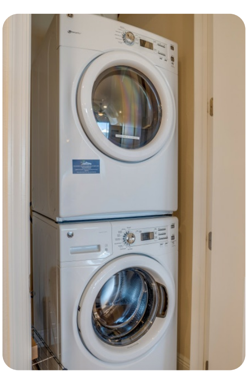
Bradenton 62 | Page 6 of 8