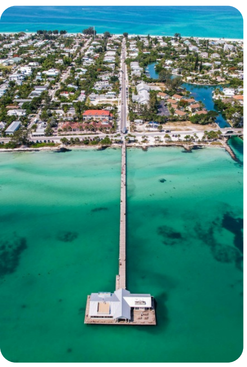
Bradenton 62 | Page 8 of 8