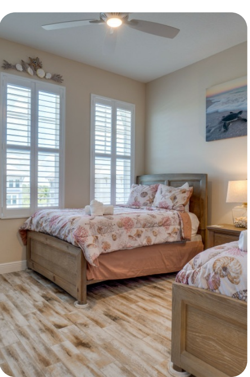
Bradenton 62 | Page 5 of 8