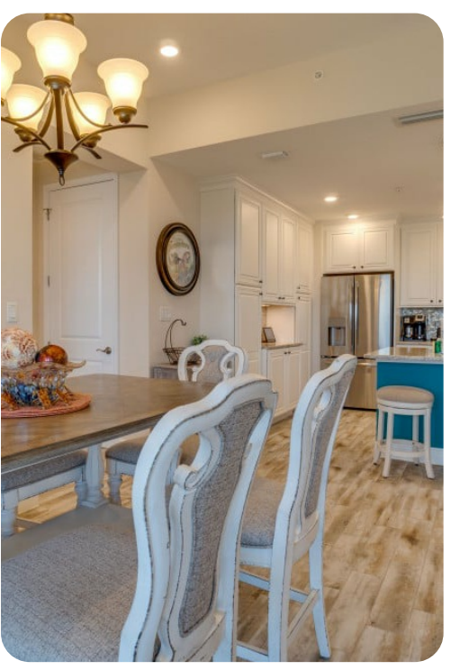
Bradenton 62 | Page 3 of 8