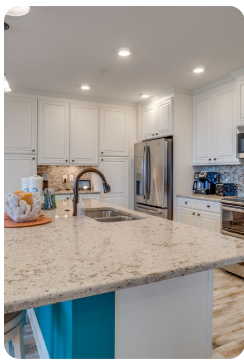
Bradenton 62 | Page 2 of 8