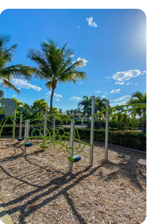
Bradenton 62 | Page 7 of 8