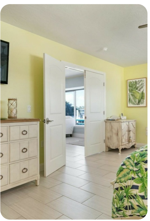
Bradenton 19 | Page 6 of 8