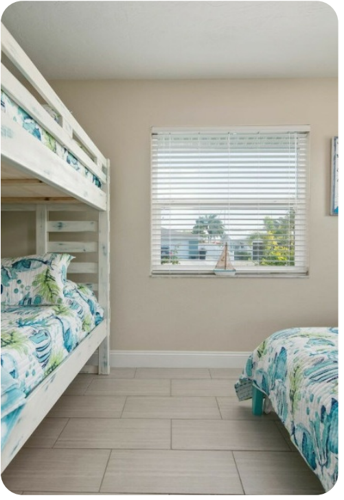
Bradenton 19 | Page 7 of 8