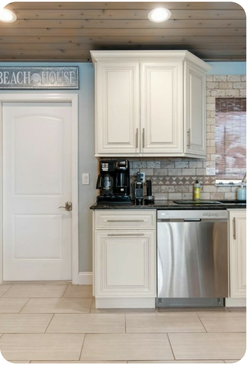
Bradenton 19 | Page 5 of 8