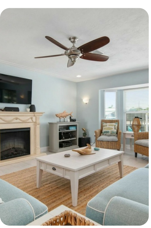
Bradenton 19 | Page 3 of 8