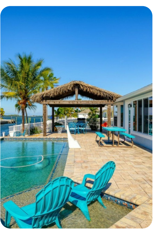
Bradenton 19 | Page 8 of 8