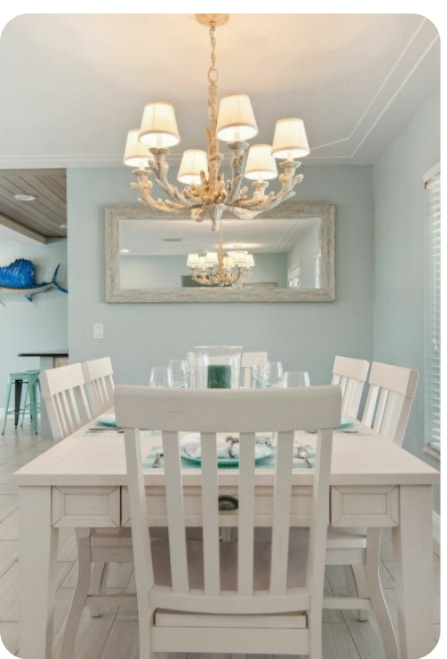
Bradenton 19 | Page 4 of 8