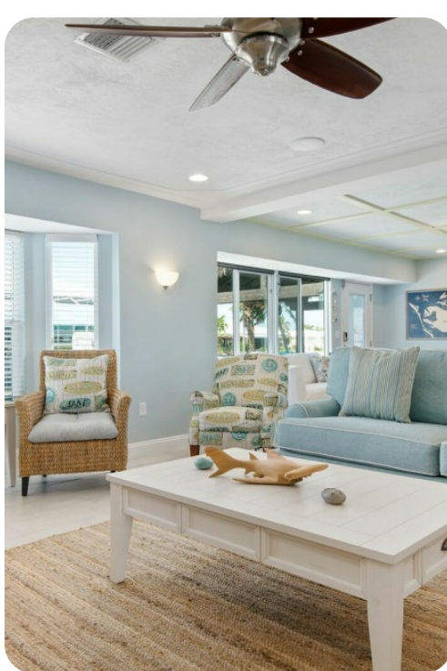
Bradenton 19 | Page 2 of 8