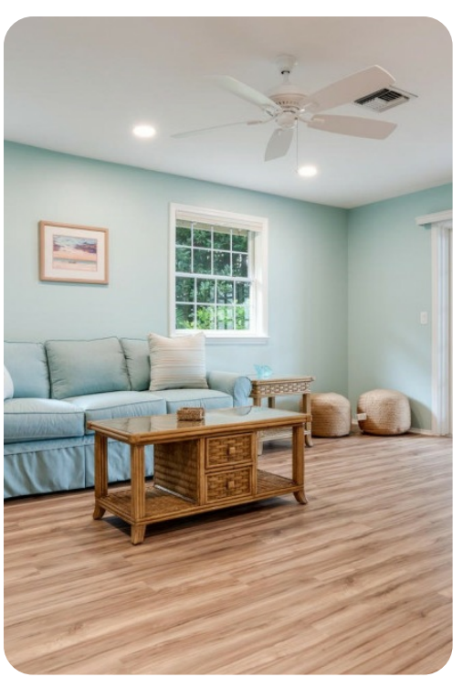
Bradenton 16 | Page 4 of 8