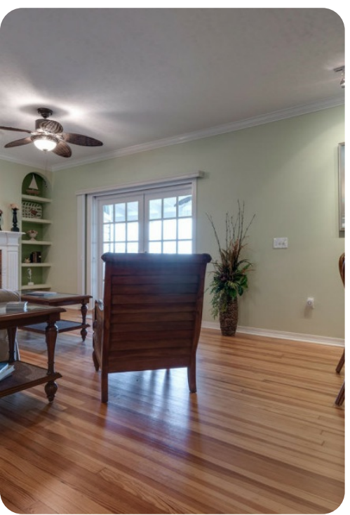
Bradenton 16 | Page 2 of 8