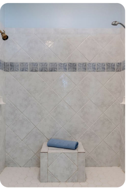
Bradenton 16 | Page 6 of 8