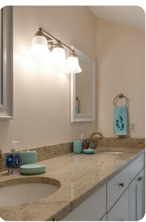
Bradenton 16 | Page 8 of 8