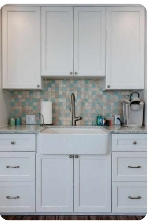
Bradenton 16 | Page 5 of 8