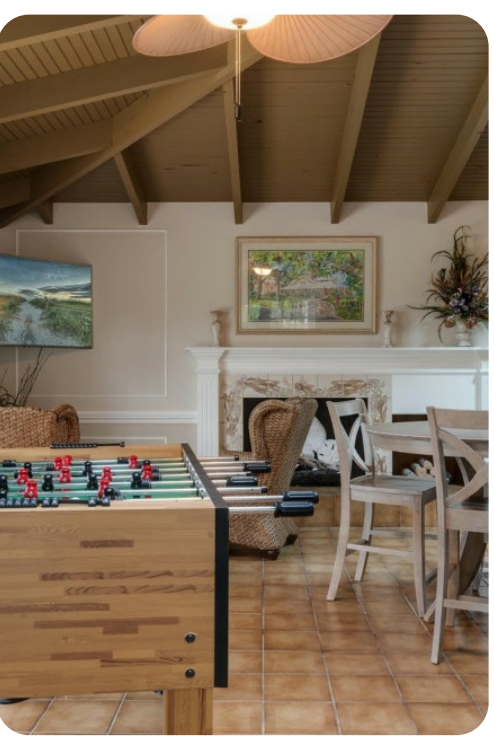
Bradenton 16 | Page 3 of 8