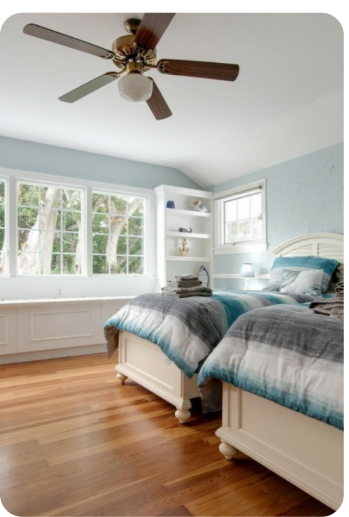
Bradenton 16 | Page 7 of 8