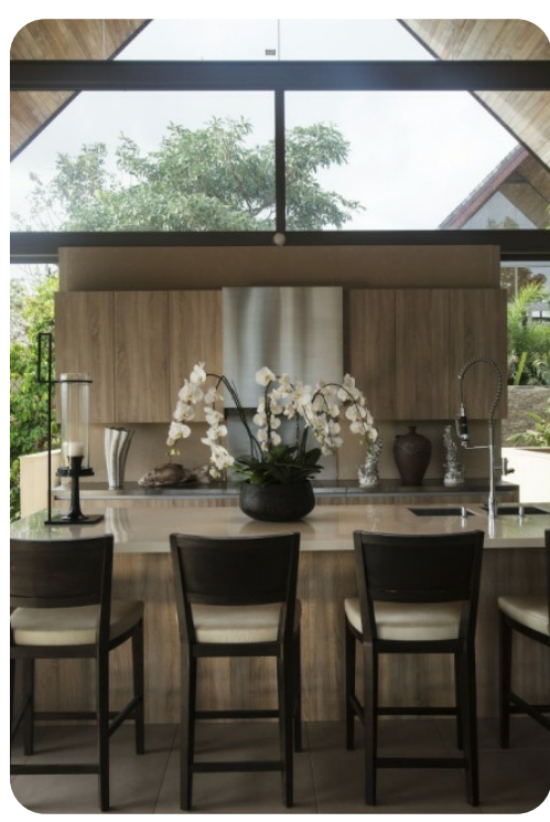
Bophut 4262 | Page 2 of 4