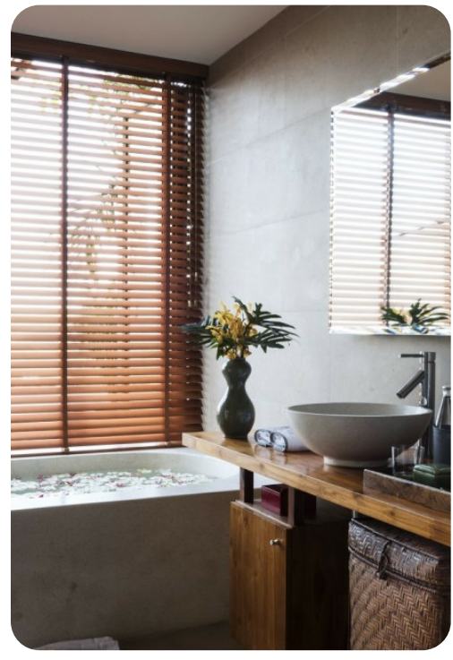
Bophut 4262 | Page 3 of 4